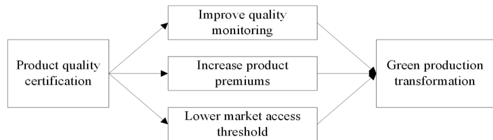
Figure 1. The pathway underlying the impact of product quality certification on the transition of green production.

H4: The degree of green production transition of farmers participating in quality certification is higher than that of those who do not.