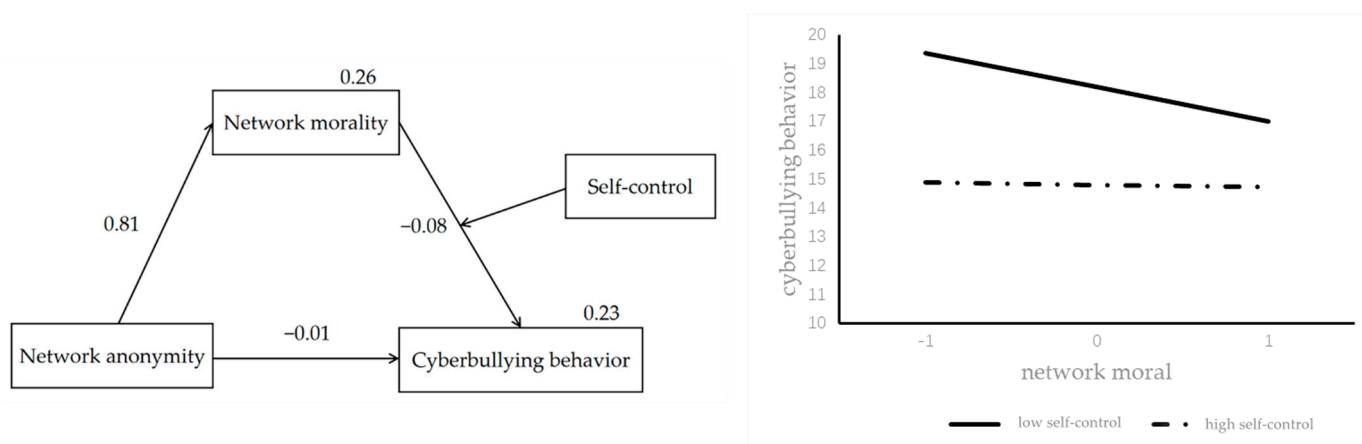
Figure 2. The model with indices (left) and the moderating role of self-control in the linkage of network morality and cyberbullying behavior (right).