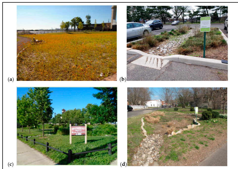
Figure 2. Photos of sample GSI projects in Waterfront South (specific locations marked on map in Figure 1): (a) a wildflower meadow in Phoenix Park; (b) a small rain garden in a publicly owned parking lot; (c) a pocket park comprising several rain gardens and vegetated areas; (d) a rain garden in a publicly owned vacant lot.