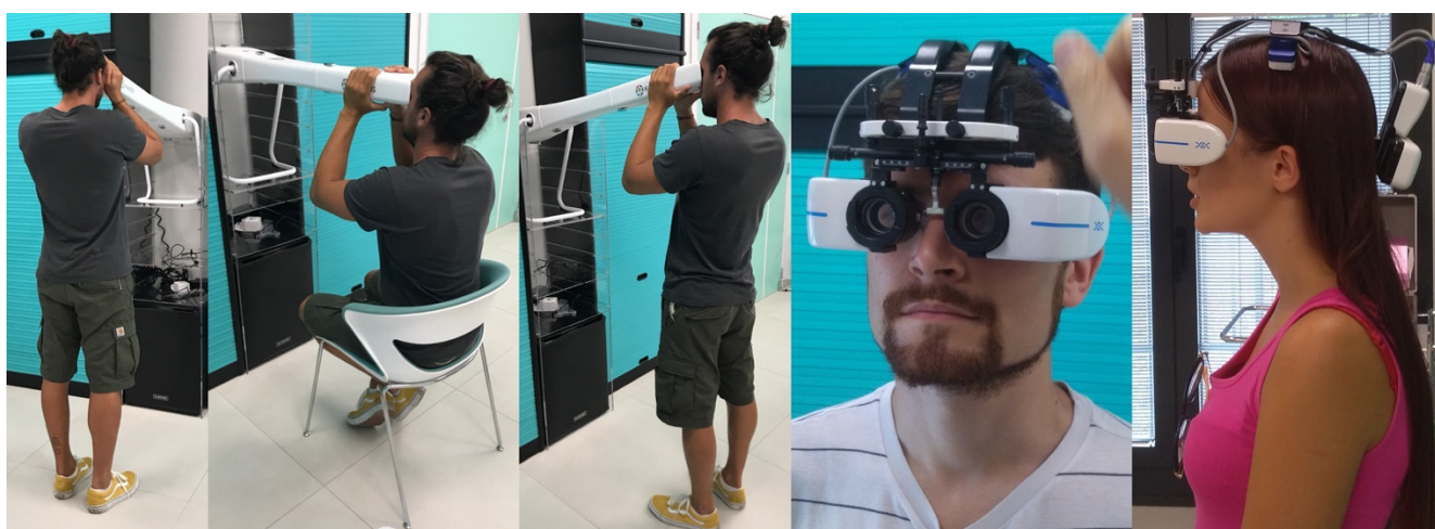
Figure 1. The different measurement conditions using Kaleidos in standing and seated position. The last 2 photos show measurement using VisionFit SC, an electronic wearable adaptive refractor.

VisionFit SC is an electronic, mobile, and wearable adaptive refractor added reference (Figure 1). It replaces both the trial frame and the manual or electronic phoropter functionalities; the trial lenses' ranges are provided by a liquid lens, automatically and easily