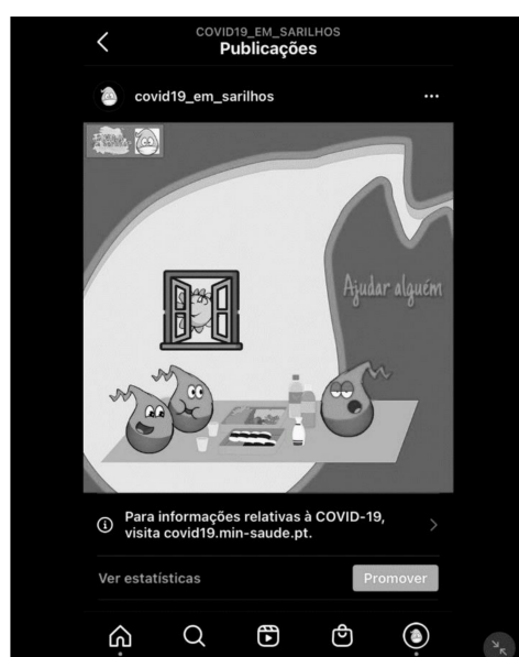
Figure 3. Instagram® post—example of the category “help someone” with the title “Indoors picnic with the family”.