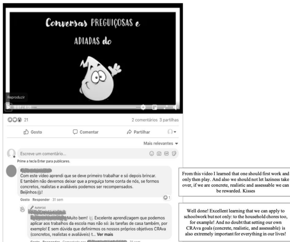
Figure 2. Facebook® post—example of the category “learn something new” with the title “Yellow’s lazy and postponed talks”.

exercise (e.g., burpees training), non-screen leisure activities (e.g., board games), and (on and off-screen) family leisure activities (e.g., movie night). Figures 2 and 3 show two examples of publications on the Facebook® and Instagram® COVID-19 Trials and Tribulations® pages, respectively.