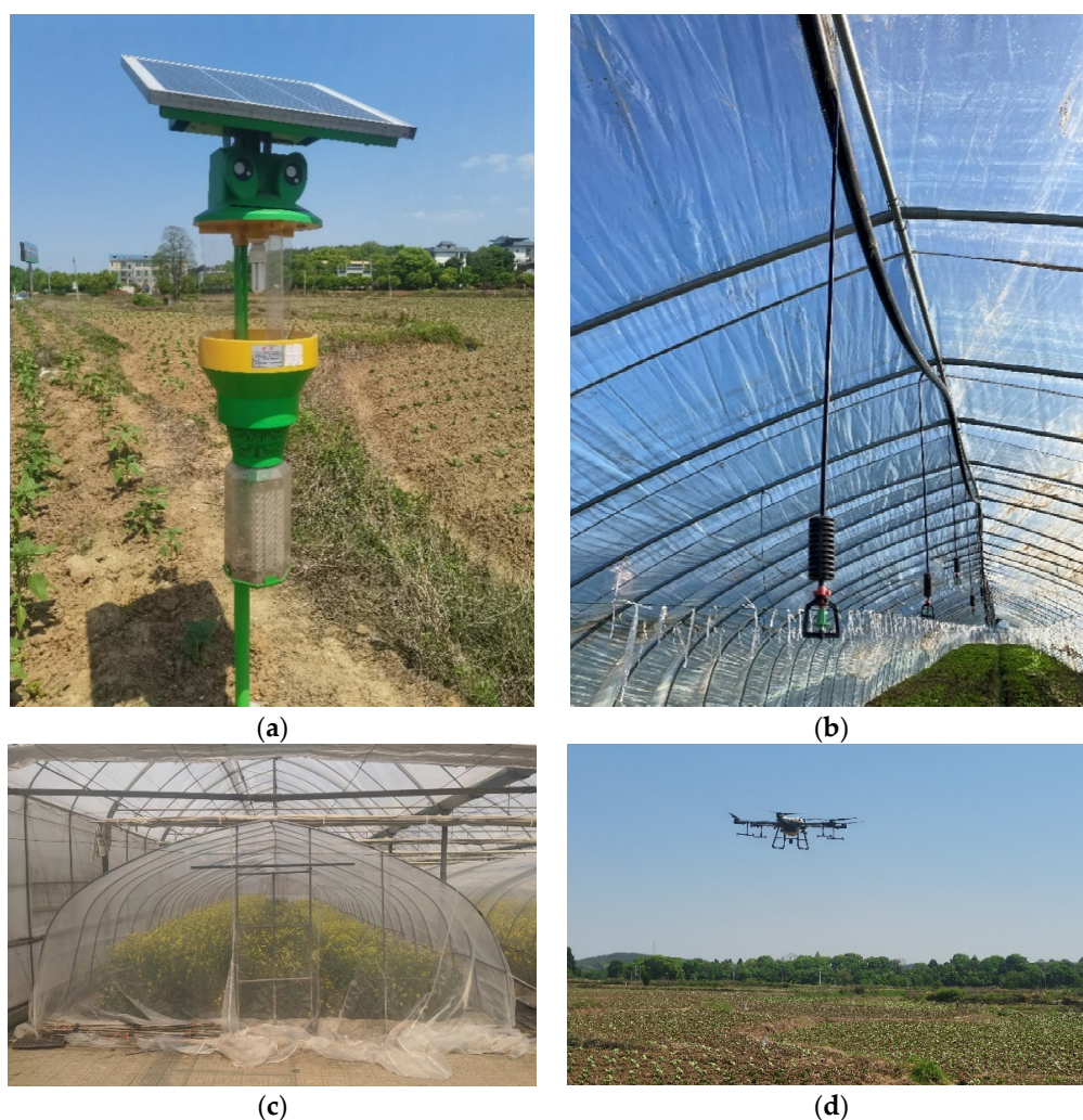
Figure 1. Related images to pesticide reduction technology.. Note: (a) Light trapping technology (solar wind type insect trap for vegetable fields). (b) Healthy crop growth technology based on scientific water and fertilizer management (water and fertilizer sprinkler irrigation). (c) Insect-proof net technology (insect-proof net for vegetable greenhouses). (d) Drones apply biopesticides in tobacco field (Validamycin + Vivo-Bacillus cereus Mixture).