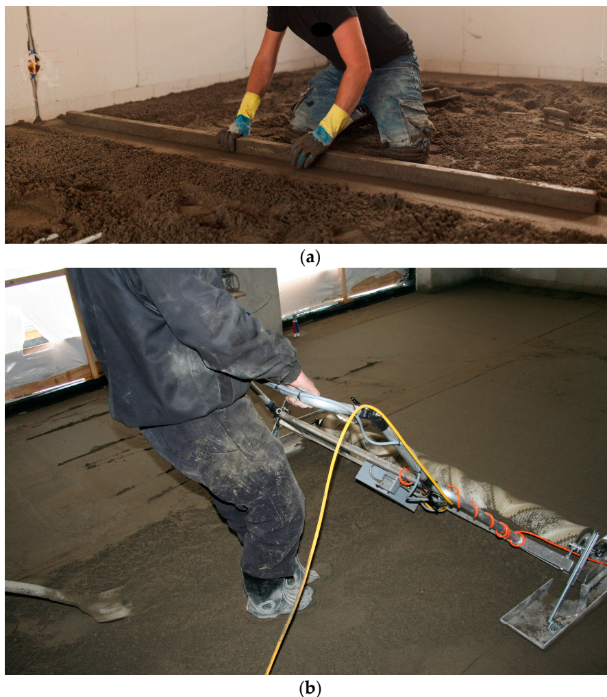
Figure 1. A sand–cement-bound screed floor layer working (a) using traditional working techniques and (b) using a manually movable screed-levelling machine.

the risk of lower back pain, lumbosacral radicular syndrome and knee osteoarthritis. To overcome this research gap, this paper aims to assess what the potential health benefits are for lower back pain, lumbosacral radicular syndrome and knee osteoarthritis using a health-impact assessment. Given that the exposure to bending of the trunk and kneeling among sand–cement-bound screed floor layers using manually movable screed-levelling machines is lower than that of using traditional working techniques, we hypothesized that manually movable screed-levelling machines result in a reduction of the risk of lower back pain, lumbosacral radicular syndrome and knee osteoarthritis. However, the real-world potential effect size has yet to be established.