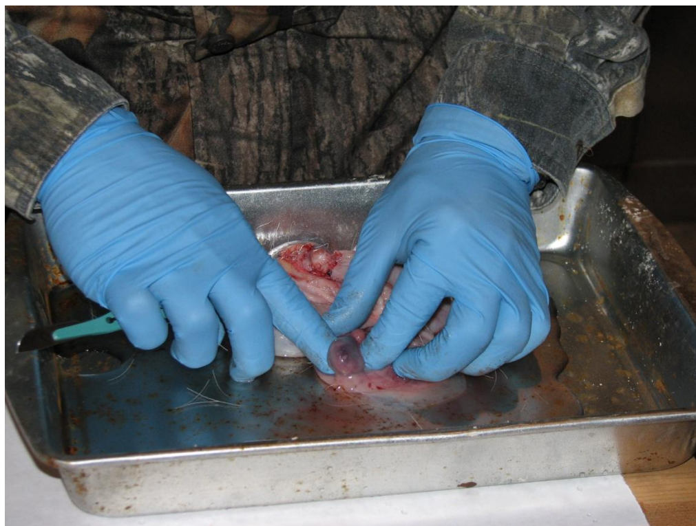
Figure 2. Conception date is determined from fetus length of white-tailed deer in Mississippi.