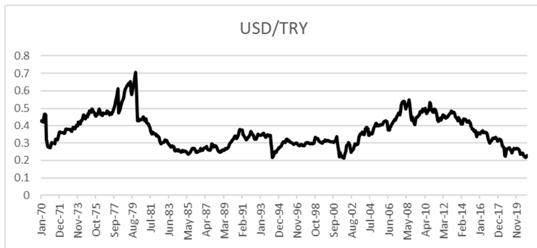
Figure 2. Real exchange rate USD/TRY.

Table 3 reports associated coefficient estimates and Table 4 diagnostic tests. In this section our analyses continue with the pass-through effects and cointegration of exchange rates and per capita income. We provide two different models for examination. First is the original ARDL model, without asymmetric effects. Next is the second model called the NARDL model, where asymmetries are included with decomposed exchange rates as partial summation.