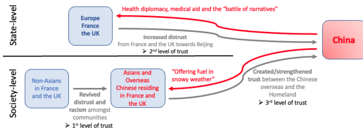
Figure 2. Multilevel (dis)trust in China–Europe relations in the early COVID-19 pandemic.

Author Contributions: Conceptualization, E.T.; methodology, E.T. and Y.-c.T.; formal analysis, E.T. and Y.-c.T.; investigation, E.T. and Y.-c.T.; resources, E.T. and Y.-c.T.; data curation, E.T. (for case study on France) and Y.-c.T. (for case study in the UK); writing—original draft preparation, E.T. and Y.-c.T.; writing—review and editing, E.T. and Y.-c.T.; visualization, E.T.; funding acquisition, E.T. All authors have read and agreed to the published version of the manuscript.