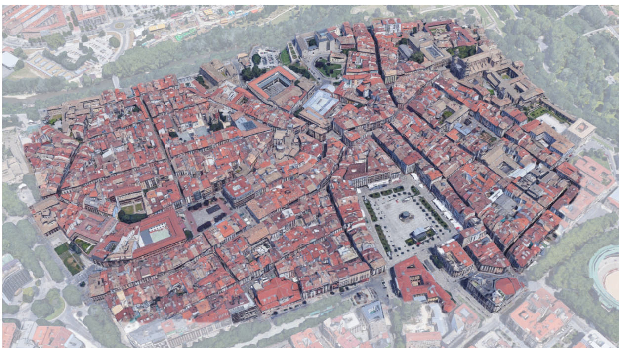
Figure 1. Pamplona City Center.