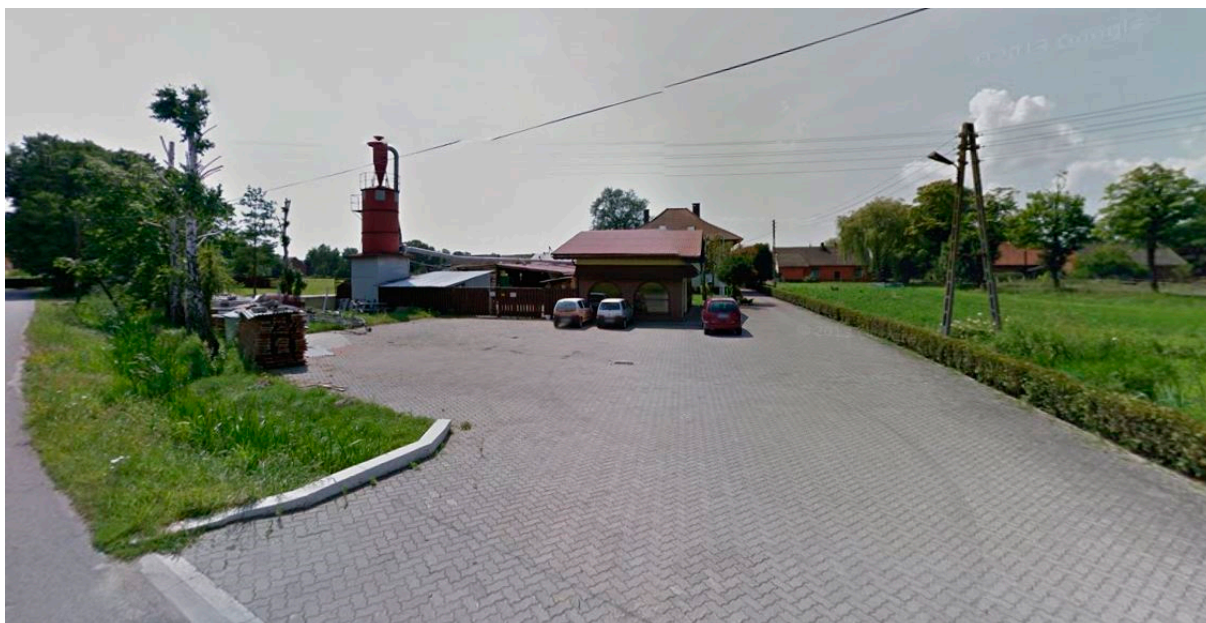
Figure S4. Sampling site in Kotórz Mały.