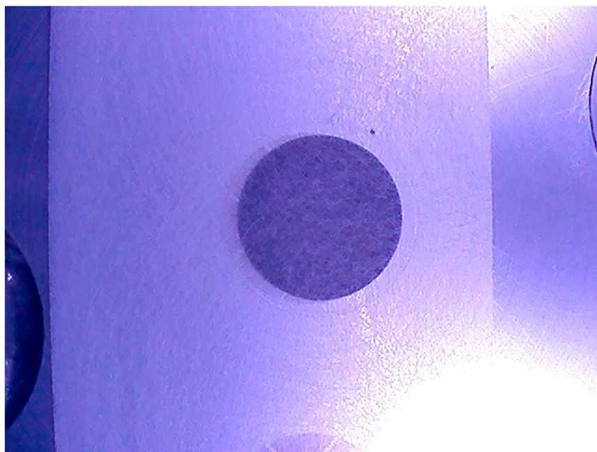
Figure S1. An example of a filter for measurements.