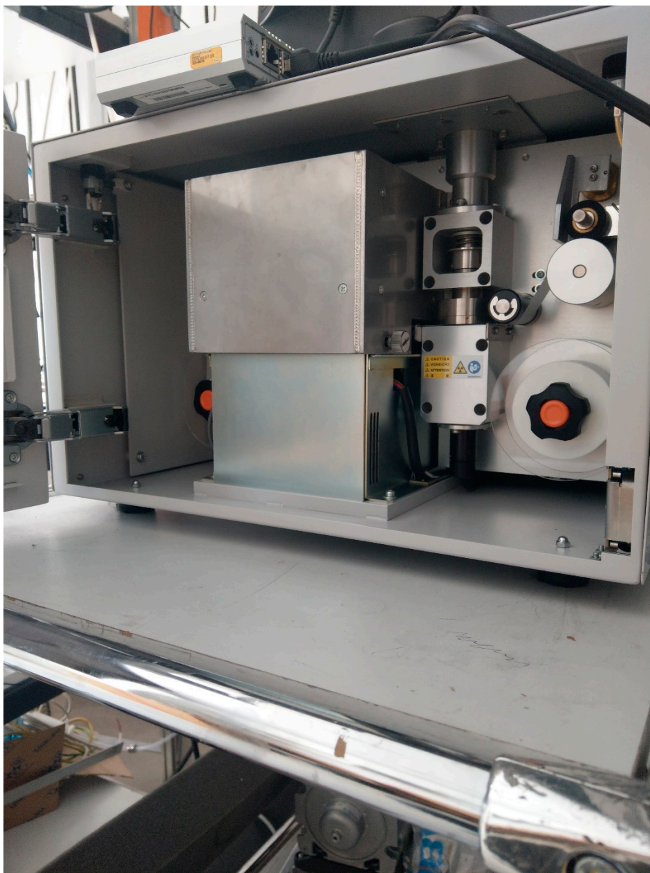
Figure S3. Measuring equipment PX-375 Horiba.