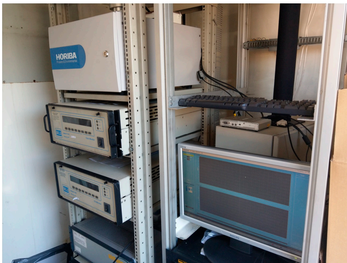
Figure S2. Measuring equipment PX-375 Horiba with other automatic analysers.