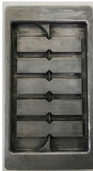
Figure S1 (ESI). Aluminium male section for Iosipescu moulds.