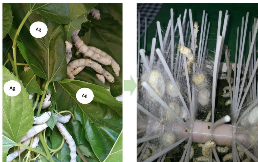
Figure 4. Representative pictures describing a method for obtaining intrinsically antibacterial silk fibroin. Silkworms fed on silver modified diet (left) produce silver doped cocoons (right) which can be processed to develop products with antibacterial properties.

of silver ions and on antibacterial capability on Staphylococcus aureus and Pseudomonas aeruginosa [114]. Silk fibers functionalized with silver nanocolloids were proposed by Dhas et al., who demonstrated that the incorporation of silver nanoparticles (AgNPs) produced an enhancement of thermal and mechanical properties and antibacterial capability against P. aeruginosa and S. aureus without a toxic effect on fibroblasts [115]. An innovative method was developed and patented by the authors Pollini and Paladini to obtain intrinsically antibacterial silk fibers directly from Bombyx mori silkworms [116]. The authors found that silver-doped silk proteins can be obtained by feeding silkworms with a silver-modified diet (Figure 4).