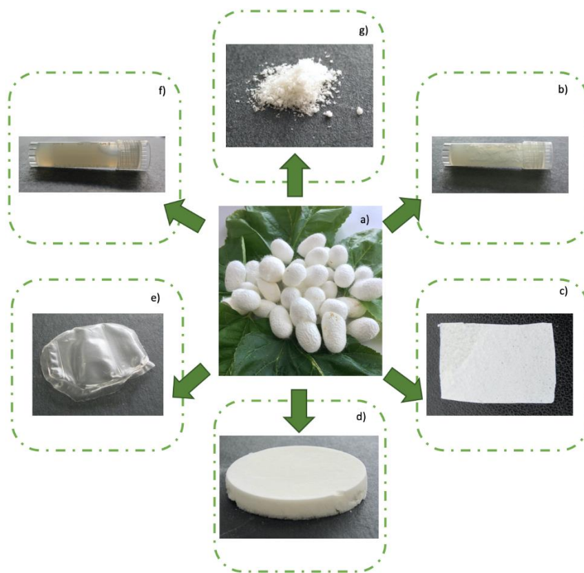
Figure 3. Examples of devices obtained by processing silkworm cocoons (a) for wound healing application: fibroin hydrogel (b), electrospun fibroin (c), sponge (d), film (e), solution (f) and powder (g).