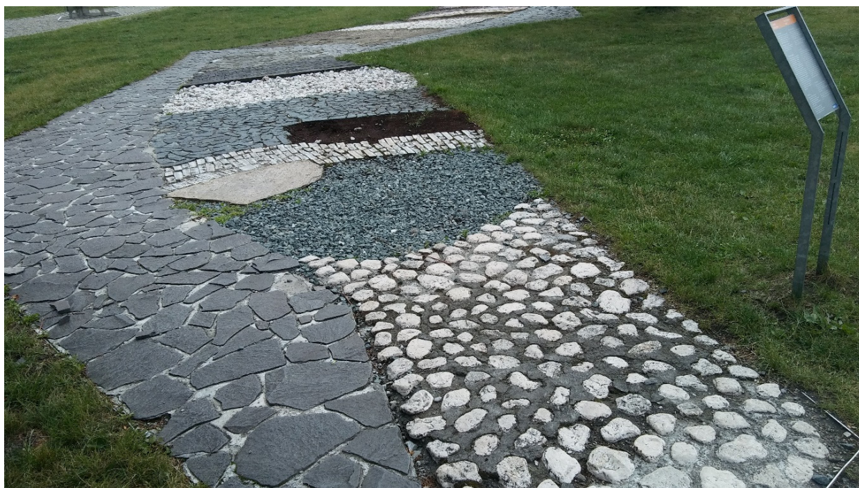
Figure 4. Diversified surface of path surface, Owińska and Kraków.