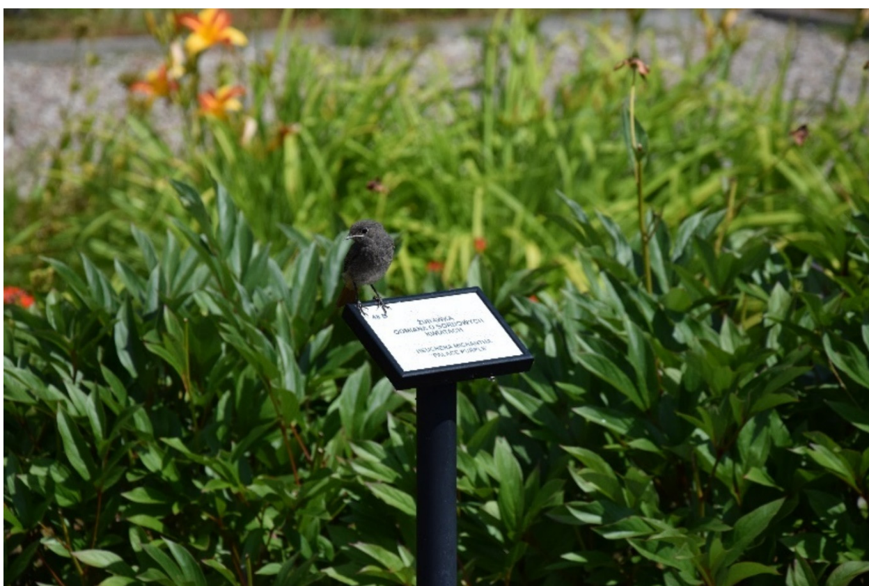
Figure 5. Waypoints described in Braille, Owińska.