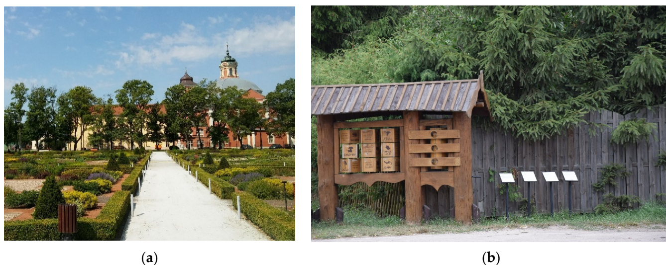
Figure 3. Clear path layout, (a) Owińska, and (b) facilities tailored to the needs of the blind, Chorzepowo.