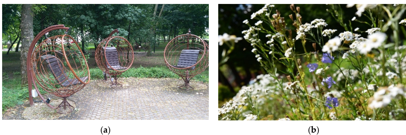
Figure 2. Scents and sounds, (a) Poddębice, (b) Owińska.

The inventory was carried out on the basis of the features considered important in spatial orientation by blind and partially-sighted people. The results of the field research showed the most commonly used solutions that facilitate relaxation, as well as independent spatial orientation, for blind and partially-sighted people, which include places identified by their smell, clear layout of paths, different path surfaces, and tips from other people (Figures 2–5). Unfortunately, other amenities considered essential were less frequently represented, and such as tactile walking surface indicators, spatial models (e.g., communication lines and terrain), and applications on mobile devices did not occur in the gardens studied (Table 2). Thus, it can be concluded that in sensory gardens, despite many amenities in terms of the uniqueness of their arrangement, many possibilities for their better adaptation to the needs of people with disabilities have not been used. The features presented in Table 2, based on the recommendations of the PWD community [17], are therefore potential applications in sensory gardens and forests.