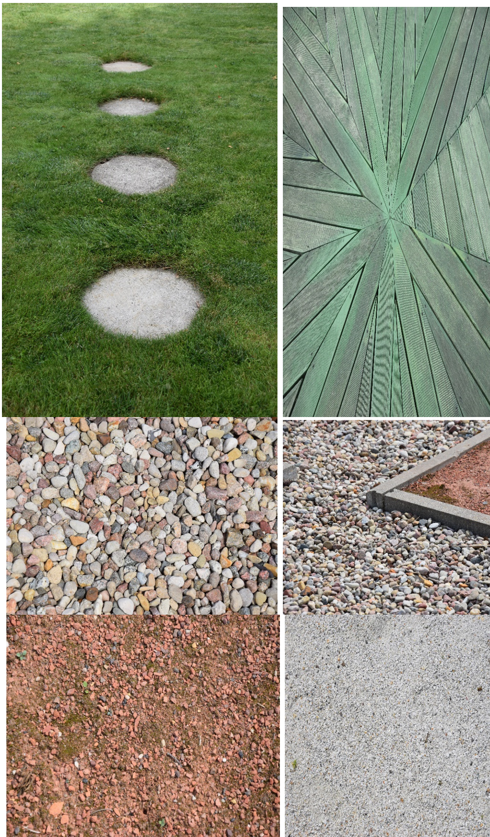
Figure 4. Cont.