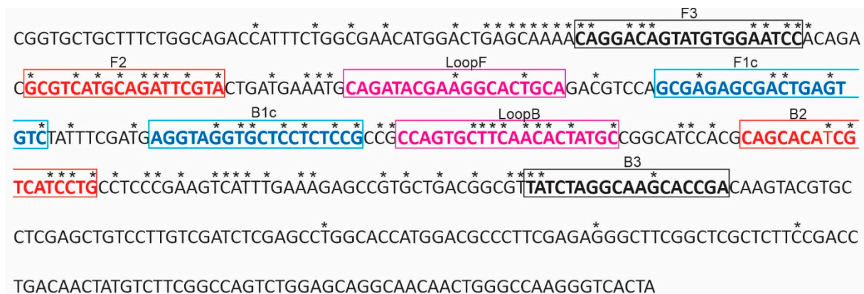
Figure 1. Position of LAMP primers based on consensus sequence of D. septosporum \beta -tubulin 2 gene sequences retrieved from GenBank (AY808205–AY808230). Primer FIP is a combination of F1c and F2, while primer BIP is a combination of B1c and B2. Differences from D. pini are noted by * symbol.