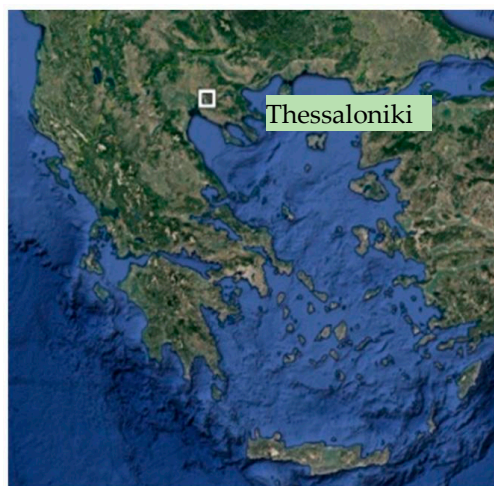
Figure 1. Map showing the study area, the peri-urban forest of Thessaloniki, northern Greece.

seedlings did not manage to survive [17], mainly due to the absolutely lacking of any post-planting care (watering, weeding, etc.). Thus, the vegetation composition in the burnt area after the fire was dominated again by P. brutia , which in most locations recruited naturally the burnt area. Today, P. brutia dominates both the un-burnt and burnt areas and comprises the stand overstory. Locally, there is an abundant understory of shrub species, the most common being: Quercus coccifera , Phillyrea latifolia , Paliurus spina-christi , and Cistus creticus , whereas in some cases (best site qualities) the species Crataegus monogyna , Fraxinus ornus , and Ulmus campestris appear [6,17].