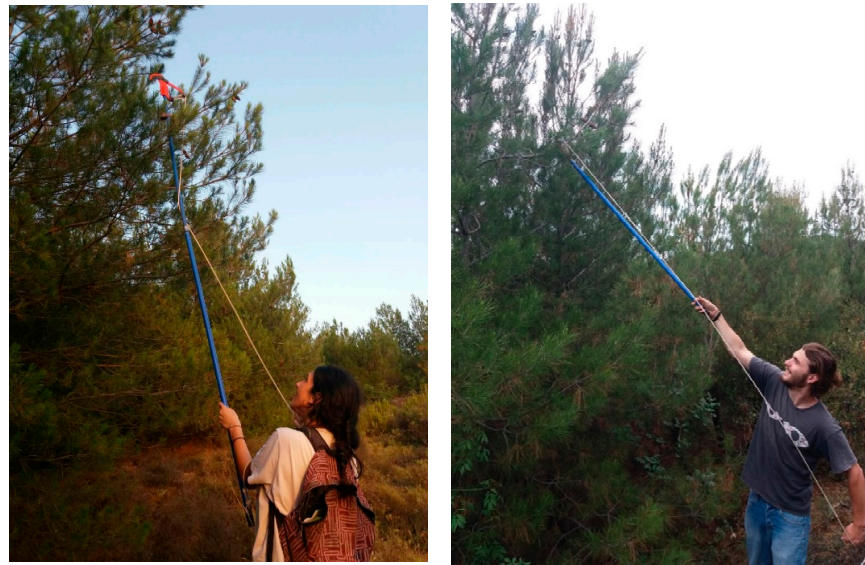
Figure 2. Cone collection in the field.