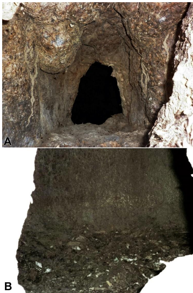
Figure 5. The entrance to the false cavity of A 257 (A). The exterior of the entrance (B). The interior of the false cavity illuminated with a flashlight.