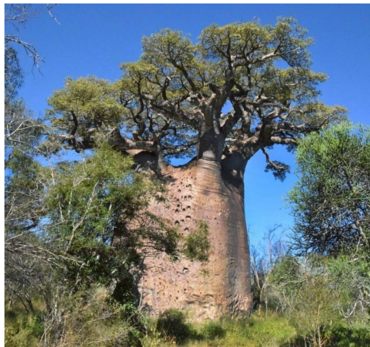
Figure 2. General view of the A 257 baobab taken from the northwest.