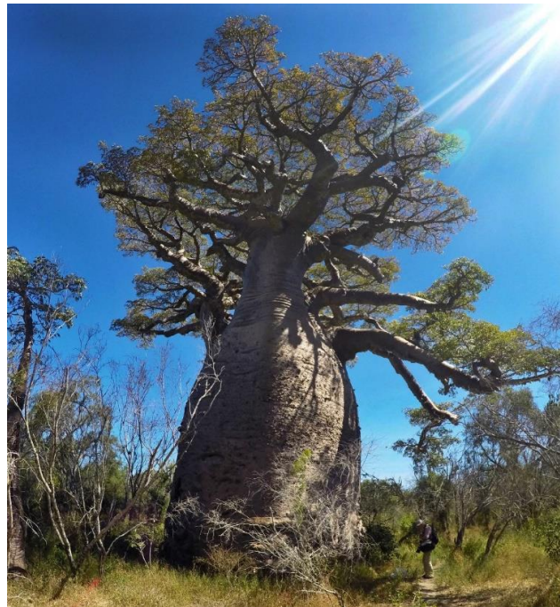
Figure 4. Image of A 257 presenting its eastern side with the shape of a bell jar.