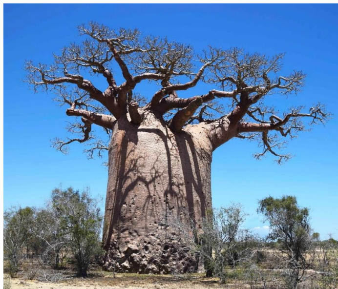
Figure 6. General view of the A 215 baobab from the northwest.

The A 215 baobab (A from Andombiry, 215 from the girth value of 21.50 m) can be found in an area of the forest with a lower density of trees and shrubs. It is located close to another dirt road, between the villages of Belitsaka and Andombiry, at a distance of 5 km from Belitsaka and 9 km from Andombiry. Its GPS coordinates are 21°38.317' S, 043°31.222' E and the altitude is 11 m. A 215 has a maximum height of 16.2 m and the circumference at breast height is 21.50 m (Figure 6). It has an overall wood volume of 320 m 3 .