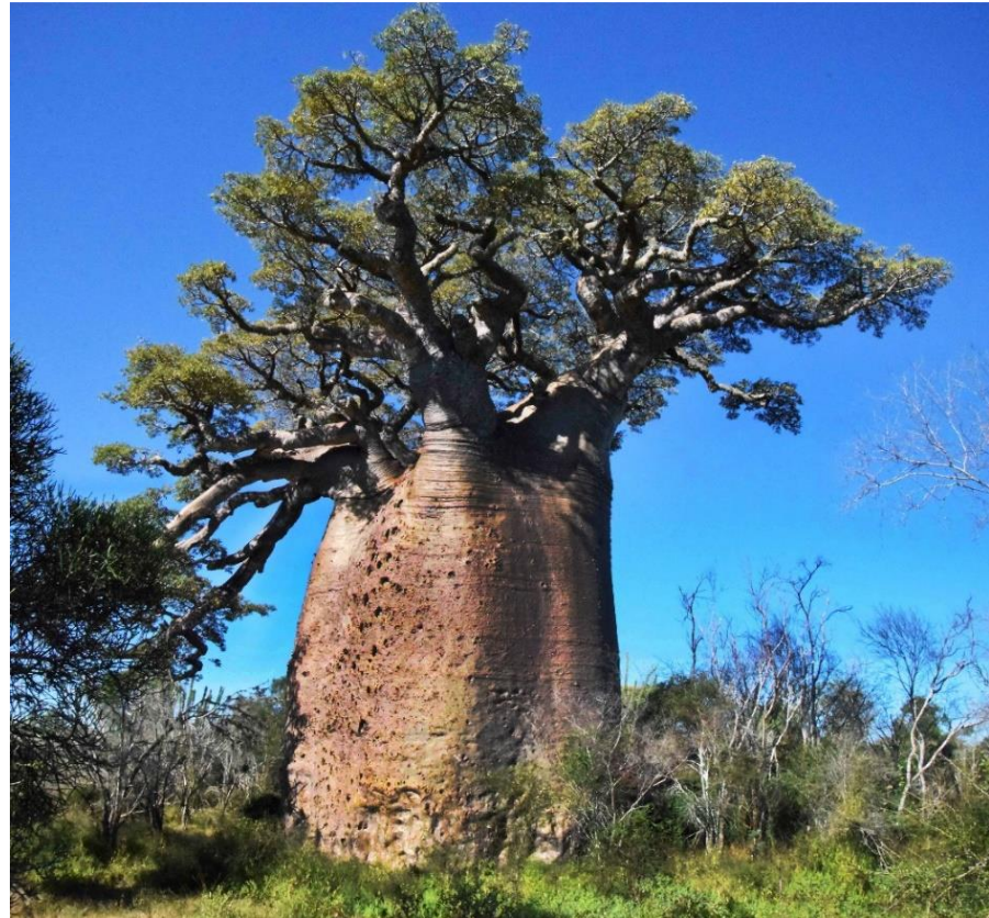
Figure 3. Photo of A 257 from the north, showing its branches pointed upward, while some are directed toward the ground.

The huge trunk exhibits a closed RSS, which consists of five perfectly fused stems around a false cavity. The trunk forks at heights of 8.7–10.2 m along the circumference. Many large Reniala from the Andombiry Forest do not correspond to the classical description of Grandidier baobabs, which implies flat-topped crowns with quasi-horizontal large branches. Thus, A 257 has the majority of its branches directed upward, while some of them are directed toward the ground (Figure 3).