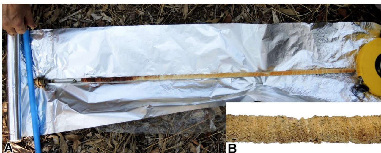
Figure 8. Photo showing sample A 257-1 being extracted from the increment borer to be wrapped in tin foil until further investigation (A). Detail of sample A 257-1, showing the growth rings, which typically become obvious 7–10 days after sampling (B).

The wood samples were collected with a Haglöf CH 800 increment borer (0.80 m long, 0.0108 m inner diameter) and wrapped in tin foil until the subsequent selection of the segments for dating (Figure 8). After each coring, the increment borer was cleaned and disinfected with methyl alcohol. The small coring holes were sealed with Steriseal (Efekto), a special polymer sealing product, for preventing infection.