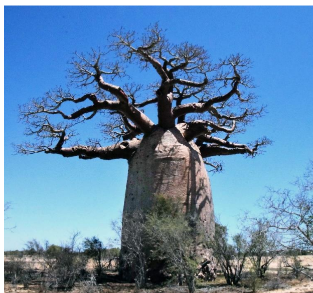
Figure 7. Photo of A 215 showing its southwestern side, which has a bell jar shape. The horizontal dimensions of the canopy are 22.8 (WE) \times 16.7 m (NS).

The trunk exhibits a closed RSS, which is composed of four perfectly fused stems around a false cavity. The false cavity is completely closed, without any opening toward the exterior. The trunk forks at heights of 9.7–10.8 m along the circumference. This trunk is cylindrical, with the exception of one side where it has the shape of a bell jar (Figure 7).