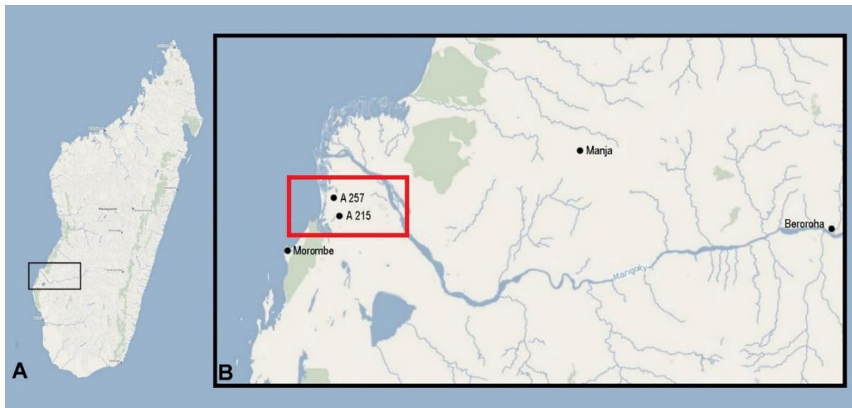
Figure 1. Map of Madagascar (A) with a detail of the investigated area, showing also the positions of the two baobabs in the red square (B).

The A 257 baobab (A from Andombiry, 257 from the girth value of 25.70 m) is located in the proximity of a dirt road connecting the villages of Isosa and Andombiry, at a distance of 8 km from Isosa and 2 km from Andombiry. Its GPS coordinates are 21^{\circ}34.804' S , 043^{\circ}30.424' E and the altitude is 8 m (Figure 1). A 257 has a maximum height of 18.5 m and the circumference at breast height (cbh; at 1.30 m above ground level) is 25.70 m (Figure 2). It has an overall wood volume of 460 m^3 . After the demise of Tsitakakoike, A 257 has the second largest circumference of all live Grandidier baobabs (the record holder Tsitakakantsa, with a girth of 28.90 m, is located at a distance of only 1.3 km).