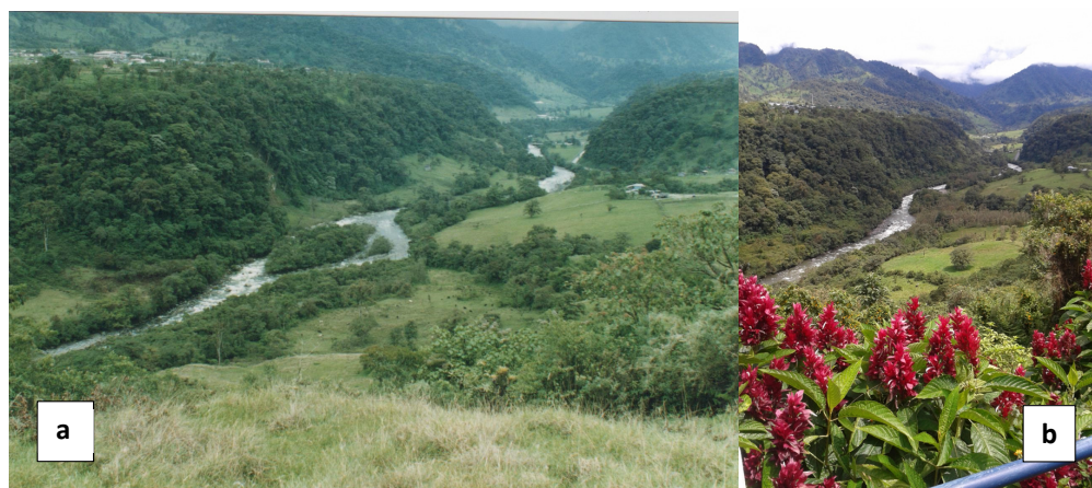
Figure 3. Panoramic view of the Quijos River at the mid-course level, near the town of Baeza at the Hostería Cumandá location, at the edge of Cumandá Protected Forest. (a) The left picture from 2010 shows the large isle that the white-waters course isolated in its rapid flow downslope. (b) In the picture on the right, taken in 2020, the isle is no longer visible in just one decade, due to human encroachment at the riverbank.

the abundant precipitation, leading to massive epiphytic gardens on the branches and exposed surfaces and waterlogging the soils [42]. Biologically, speciation is very active in this ridge-and-valley topography, where constant humidity produces cloudiness that enhances UV- \beta radiation, favoring mutation rate and stimulating speciation [25,42]. In Eastern Ecuador, there is one continuous cloud forest surrounding the city of Baeza. The high degree of biodiversity in the tropical montane cloud forest belt is impressive in almost every taxon [42,43]. A profusion of lauraceous trees with aroids, mosses, ferns, and orchids occurs mostly between 1800–2200 m, as an ecotonal height for the intermixing of both forest types, as predicted by Grubb's classification [29], who compared lower (700–1800 m) and upper (1800–3400 m) montane forests in Tropicandean landscapes, as an intermediate zone of mid-elevation forests has been identified [30], where Cecropia sp., Ceroxylum alpinum and Dictyocaryum sp. are conspicuous (Figure 3).