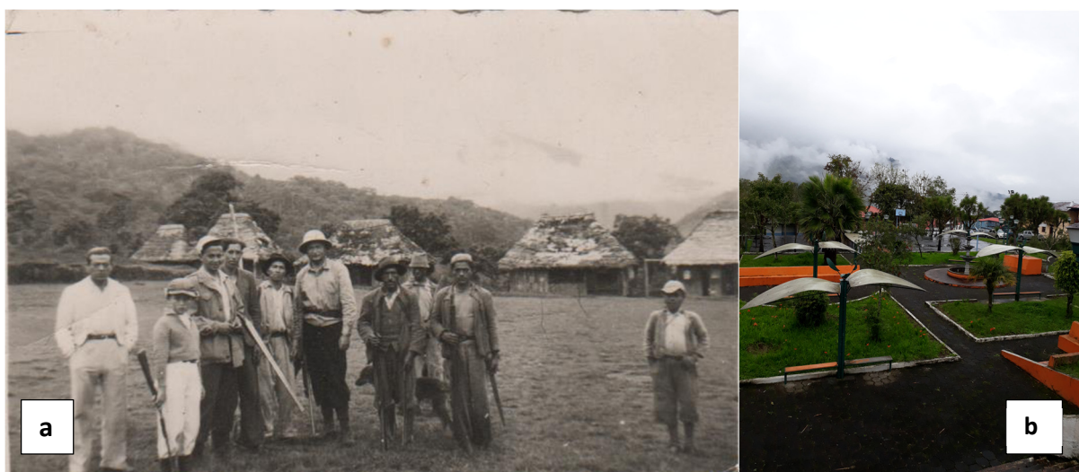
Figure 5. The left picture (a) shows the settlers and explorers in the central plaza of the old town of Baeza in 1950. Note the bare terrain and the huts as housing. On the right (b), the new plaza in 2020 with distinctive benches, electric posts, many trees, manicured gardens, paved roads, and traffic on the side road. Source (a) from Jack Rodríguez, Mar 1952. Source (b) from Jack Rodríguez, 22 September 2021.