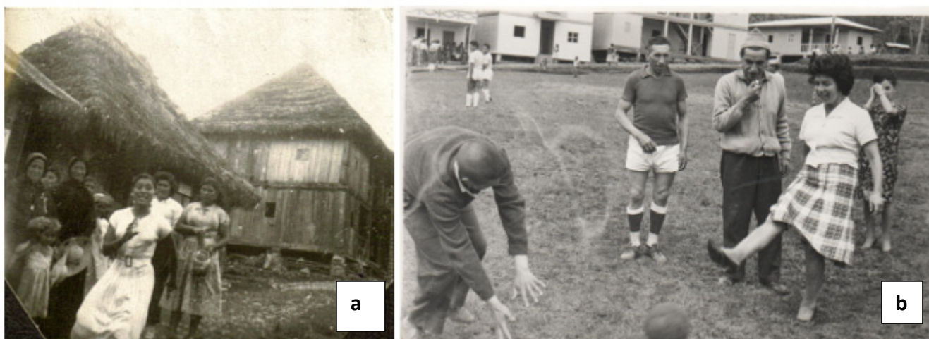
Figure 6. Women have been present in formalizing and promoting conservation programs and other sustainable development ventures in the area. The left picture (a) shows the original wooden structures with thatch roof, while on the right (b) the houses are already brick with metal roofs.