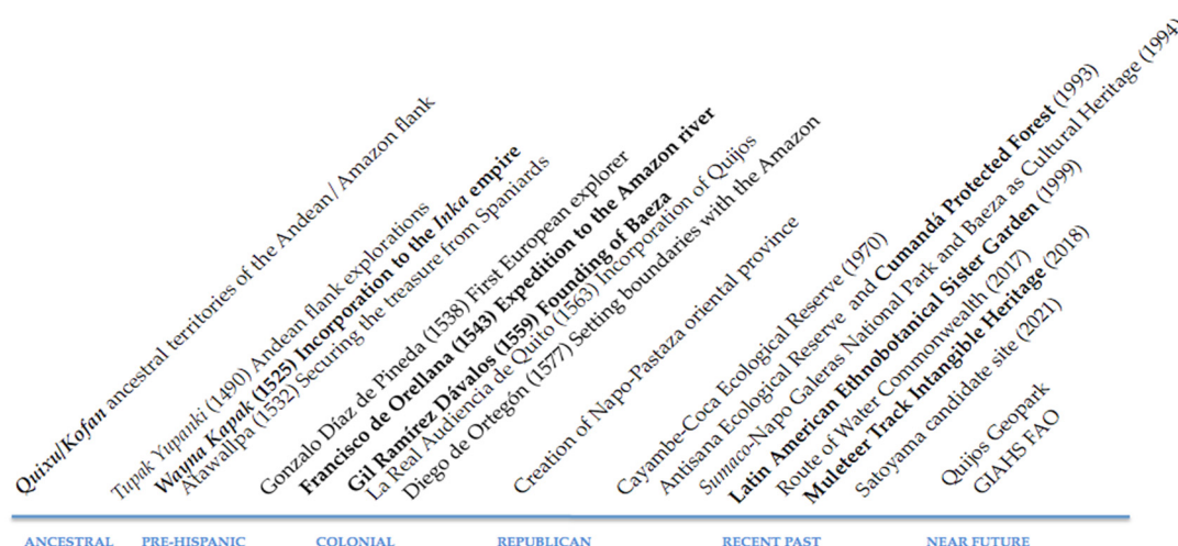
Figure 4. Timeline of the discovery and conservation efforts in the Quijos River valley in the Andean flank of the Ecuadorian Amazon, from prehistoric accounts to the historicity of the present, into the near future.

The timeline of the Quijos valley is shown in Figure 4, where the prominence of colonial explorations towards the Amazon rivalled those in the Colombian valleys and in the southern Ecuadorian mountain passes towards the Marañón River, as described by the French Geodesic Mission, who followed route maps of Salesian, Jesuits, Dominican, and Franciscan monks, who entered the Amazon with the first Spaniards. The fame of the Wamani pass became apparent when supplies of rich spices and tropical produce started flooding the vegetable markets of Quito residents, who soon appropriated the area of the “land of cinnamon” and claimed the “discovery” of the Amazon River to the world.