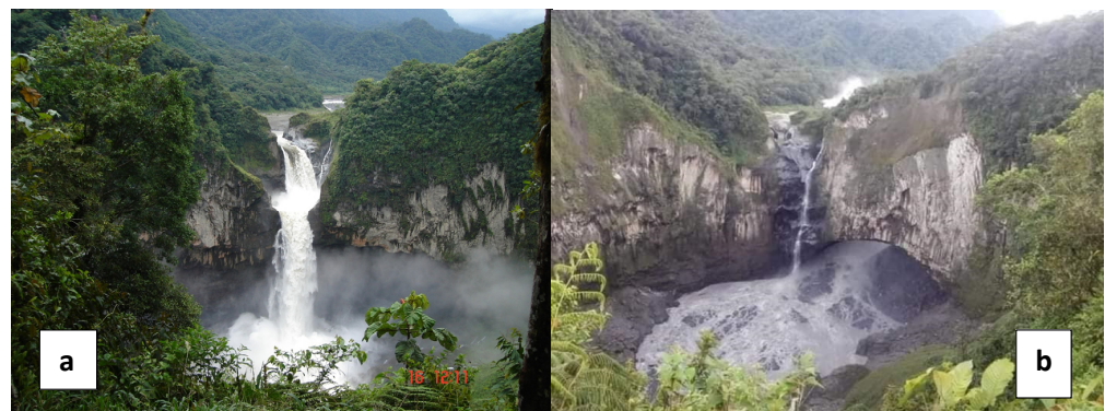
Figure 2. The San Rafael waterfall at the terminus of the Quijos river. (a) The left image is the historical flow and scenic beauty of the tallest waterfall in Ecuador. (b) The right image shows the change in the current flow that responded to natural causes of erosion; however, there are hints reflecting intensive manipulation of the riverine areas for the Coca-Codo Sinclair hydroelectric megaproject nearby. Source (a): Photo from Neotropical Montology Collaboratory, 16 December 2011. Source (b): Photo from Jack Rodríguez, 12 August 2021.