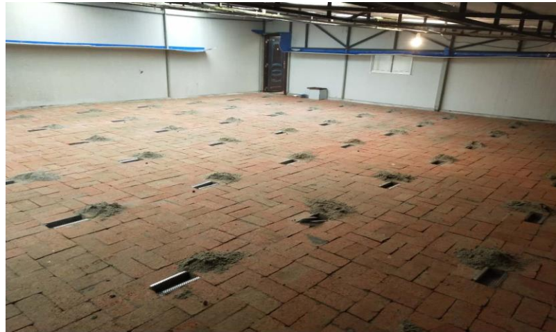
Figure S2. An illustration of an enclosure used in this study.