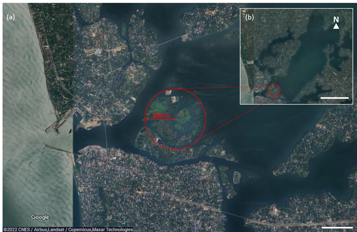
Figure S1. (a) Detail of the Ashtamudi Lake (Kerala, India) with the sample location of the five studied mangrove species indicated by a red circle with radius 500 m. Scale bar = 0.5 km. (b) Overview of the entire Ashtamudi Lake with the sample location indicated by a red circle. Scale bar = 2.5 km.