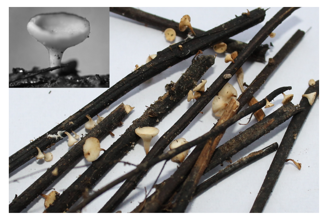
Figure 3. Ash cup—fruiting body of the H. fraxineus.

Until 2011, the two names Chalara fraxinea and Hymenoscyphus pseudoalbidus were used interchangeably. However, according to the decision of the International Botanical Congress of 2011, dimorphic fungi should have only one name. Genetic studies have shown that the causal agent of ash dieback is closer to the genus Hymenoscyphus than to Chalara . Since the term "fraxinea" was widely used in the literature, it was decided to combine it with the taxonomically correct " Hymenoscyphus " [33]. Currently, the accepted name of the fungus is Hymenoscyphus fraxineus (T. Kowalski) Baral, Queloz, Hosoya, comb. Nov.; basionym: Chalara fraxinea T. Kowalski; synonym: Hymenoscyphus pseudoalbidus Queloz et al. The term ash cup was adopted as the Polish name because the fungus in the teleomorphic stage produces characteristic "cups" (Figure 3) with a diameter of 1.5 to 3.0 (7.0) mm [87].