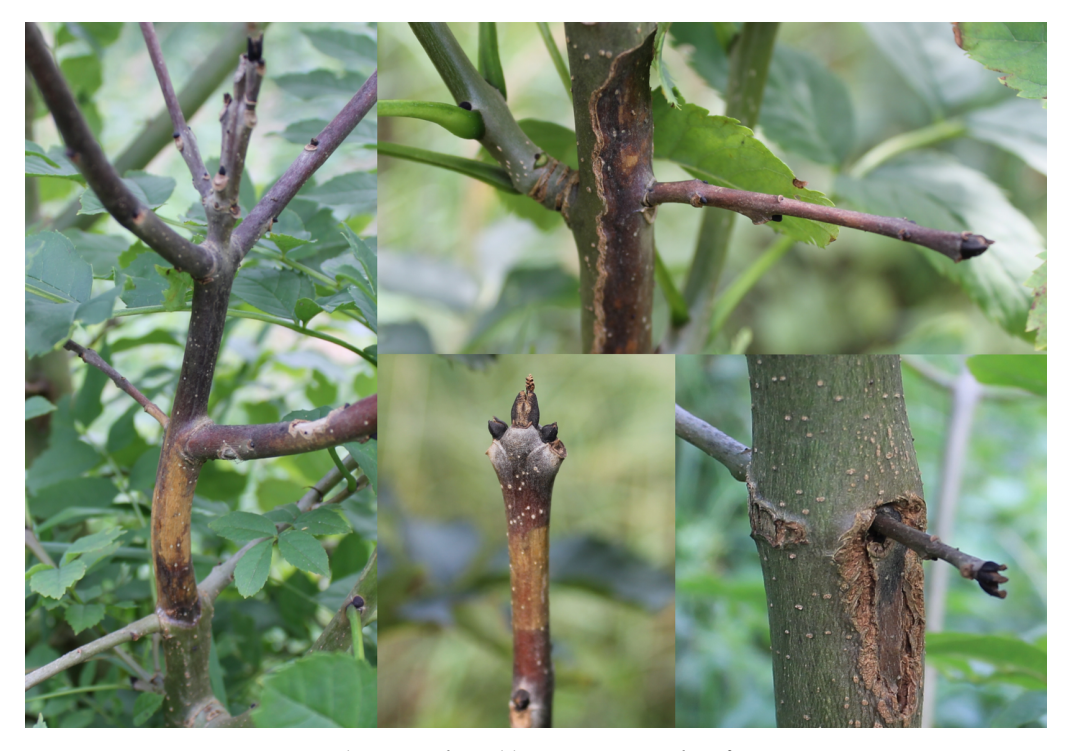
Figure 4. Damage to young ash trees infected by ascospores of H. fraxineus.

Infected trees show some symptoms resembling frost damage from a distance [63], such as loss of foliage, leaf discolouration and necrosis, reduced fruiting, etc. [98]. A characteristic symptom and one of the earliest is frequent discolouration near the central vein of leaves. The growth of hyphae through plant tissue leads to the death of successive shoots, and this can even cover entire tree crowns. The most important symptom is the wilting of leaves (as hyphae develop inside vessels and parenchyma of whorl rays, and interfere with the transport of water and assimilates), and the subsequent tissue necrosis is visible on the surface of the shoot bark [87,92]. This leads to the death of parts of the shoots located above the infection site (Figure 4).