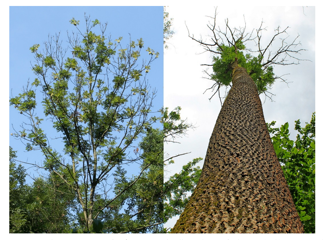
Figure 2. Pathogen Hymenoscyphus fraxineus atacks all age classes of ash trees. ( Left ) 30 years and ( Right ) 100-year-old ash trees ( F. excelsior L.).

Ash shoot dieback, which has been observed throughout Europe since the early 1990s, is a problem for both forestry and nature conservation (Figure 2). As common ash rarely forms solid stands, little commercial attention has been paid to it [9]. The current proportion of common ash in the total forest area of Europe is small and amounts to less than 1% [56]. Outside the forest, common ash is a valued shade and roadside tree and is common along avenues in the rural landscape. However, due to late leaf development, depletion of soil nutrients around the occupied area, lack of use by bees and faster growth than other trees, the ash has seen little use as a park tree [57]. Common ash has always been valued and used because it is considered a particularly "healthy" tree to which positive bio-energetic effects are attributed [58]. Ash wood has long been widely used because of its desirable properties and aesthetic appearance [52]. In the past, ash wood was used to make spears, lances for cavalry, and skis, and the leafy branches were fed to animals [59]. The wood was used to build railway carriages, to furnish luxury carriages, but also to build skeletons of entire carriages [60].