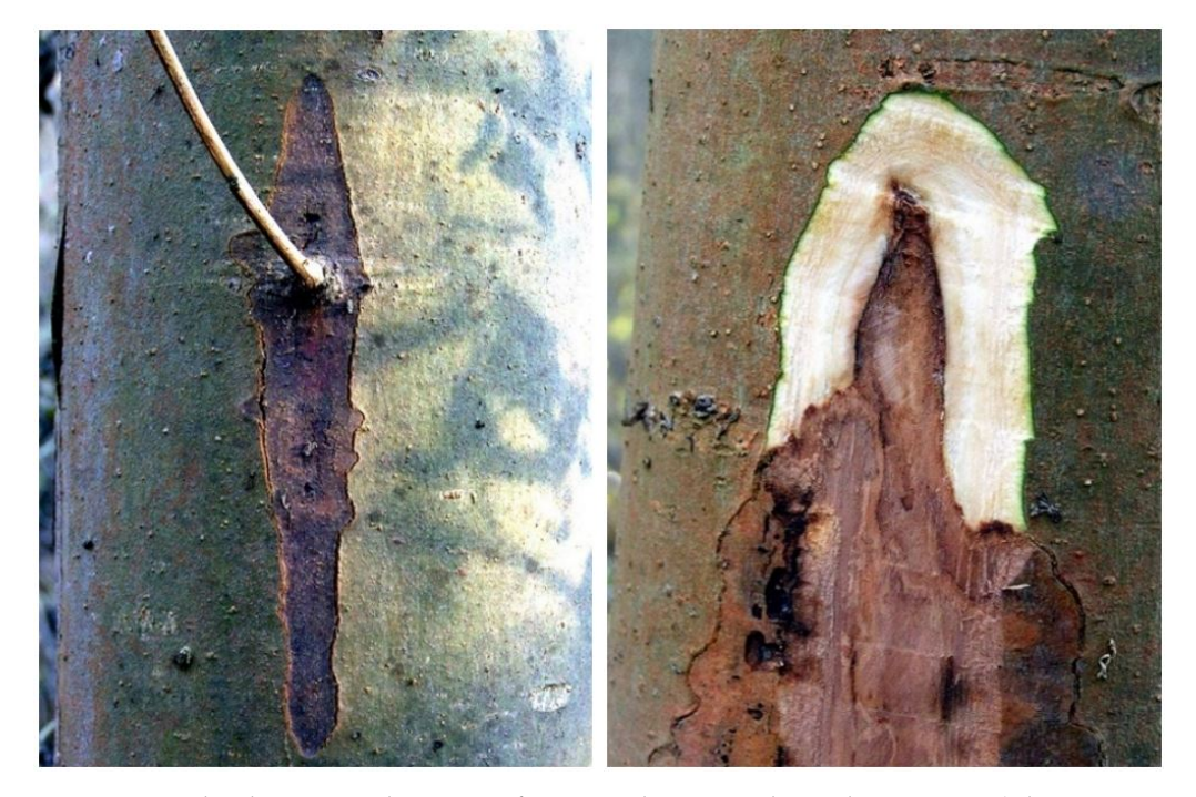
Figure 5. Canker lesions on the stems of young ash trees in the Wolica Reserve (Chojnów Forest District) caused by the fungus H. fraxineus.

Diseased ash trees tend to drop their leaves by early autumn and many trees are deprived of photosynthetic tissues by the end of September [78,87]. In younger trees, cancerous changes can be observed on the trunks, rarely in connection with sap secretions from diseased tissues (Figure 5).