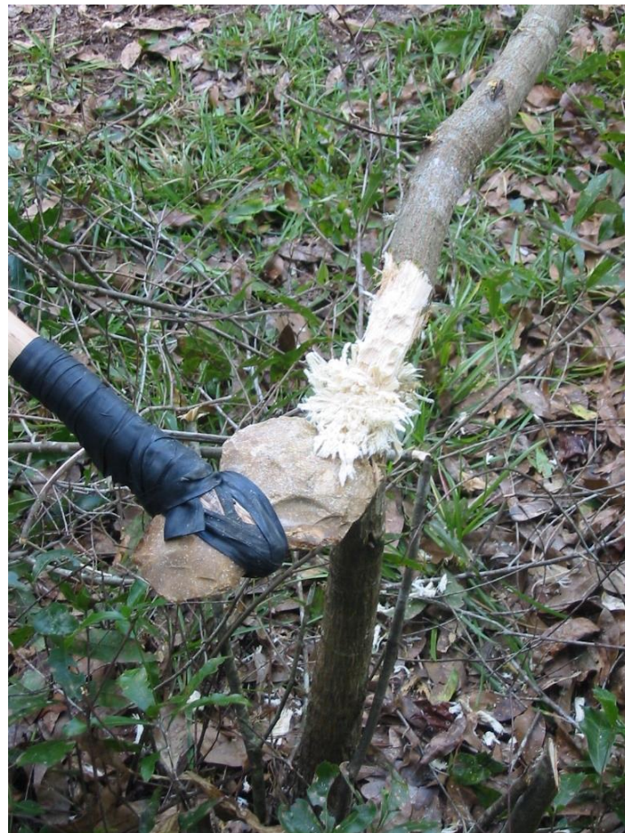
Figure 1. Quercus hemisphaerica (laurel oak) sapling felled with a stone axe hafted to a Ostrya virginiana handle with a bicycle inner tube showing the effects of a typical cut.

Given the high breaking strength and potential sharpness of steel coupled with the great force generated by using upper body strength when chopping, experienced and muscular steel axe wielders can cut through wood rapidly. In contrast, stone axe heads fracture easily and dull rapidly if knapped to a sharp edge; hafts are also likely to loosen or break under severe stress. As explained in detail by Jørgensen [3], in contrast to the full body motion of steel axe wielding, felling trees with stone axes is most effectively accomplished with numerous short strokes made at steep angles to the stem; the vertically oriented wood fibers are peeled apart rather than being cut across (Figure 1). Based on the technique required for stone axe use and the few available descriptions of roles in Neolithic agriculture [10,11], we expected no difference between males and females in felling efficiency with stone axes. We tested these hypotheses with a factorial experiment in which male and female volunteers used stone and steel axes to fell small trees, half of which were bent over while being chopped.