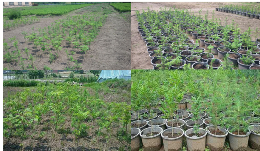
Figure 1. Larch and ashtree young trees planted with mixed banding forests in the field and in pots.