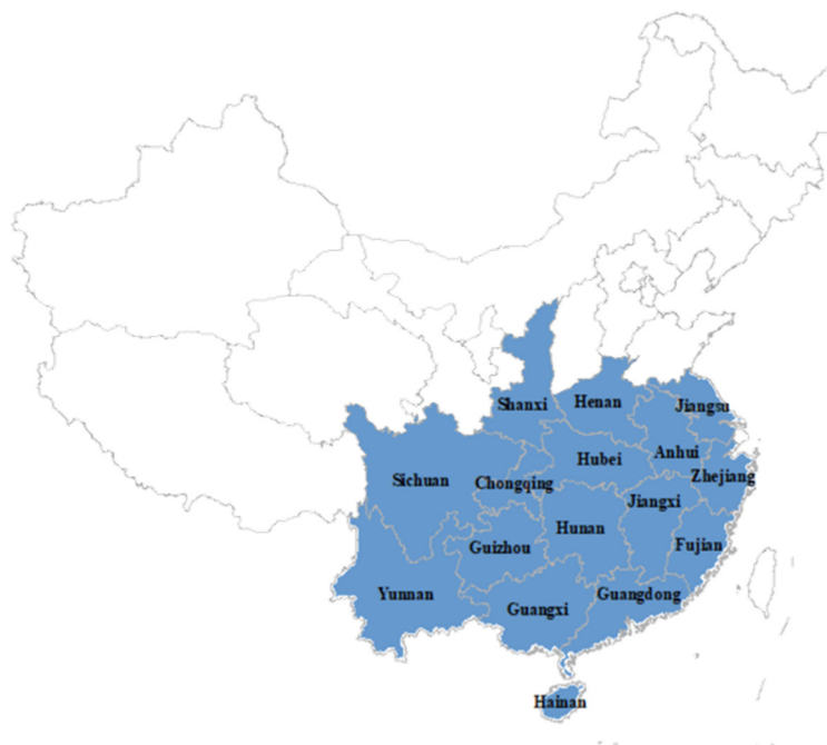
Figure 2. The bamboo distribution of 16 provinces in China.

of the data and the remaining four provinces having very little distribution of bamboo forests, only 16 provinces were selected for this study (shown in Figure 2). Among these, 8 provinces boast forest areas exceeding 300,000 hm 2 each. These provinces, namely, Fujian, Jiangxi, Hunan, Zhejiang, Sichuan, Guangdong, Guangxi, and Anhui, collectively cover a total area of 6.785 million hm 2 , accounting for 89.72% of the bamboo forest area in China (NFGA, 2023).