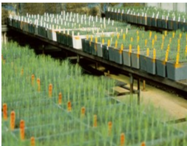
Figure 3. The left panel shows multiple pine seedlings from a specific seed lot that (from 1973–1983) were planted together in trays of locally available mountain topsoil mixed with sand and peat moss. The right panel shows trays of single pine seedlings from a given seed lot that were planted in individual plastic tubes containing a mix of non-sterilized commercially available peat moss, vermiculite, and perlite. These containerized trays of seedlings, each in their individual plastic tubes, were used in all RSC “Operational” and “Research” tests beginning in 1984.