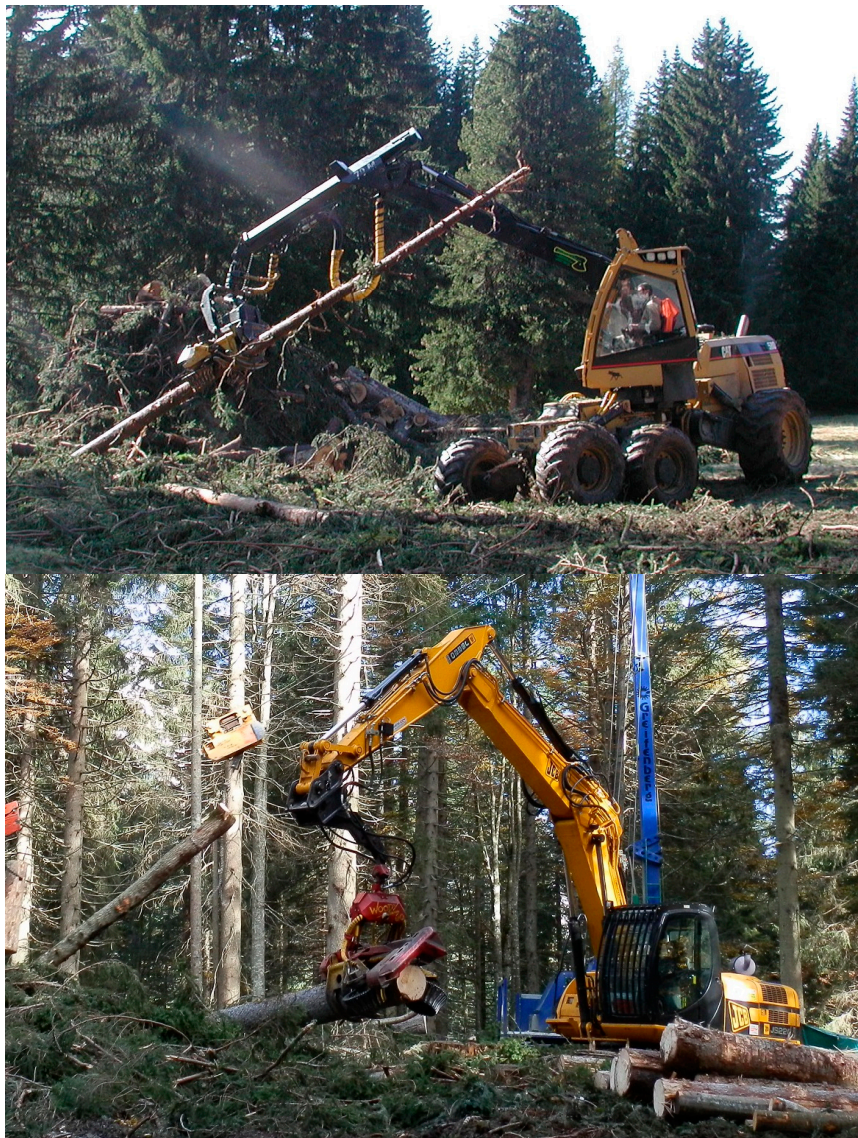
Figure 1. Example of the purpose-built ( top ) and excavator-based ( bottom ) units in the study. These are respectively unit # 2 and # 6.

same logging company, but they were operated by different drivers. All the selected machines were used for one single shift, which is current practice in Italy.