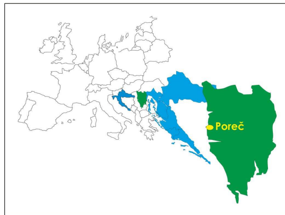
Figure 2. Geographical location of study area.