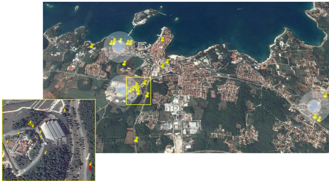
Figure 4. Global view of the satellite map of the A. altissima infestation in Poreč City as shown by Google Earth Pro software. Pins (yellow) and polygons (orange, red) indicating infestation are shown. Transparent circles represent locations of source A. altissima trees and distribution of invasion sites.