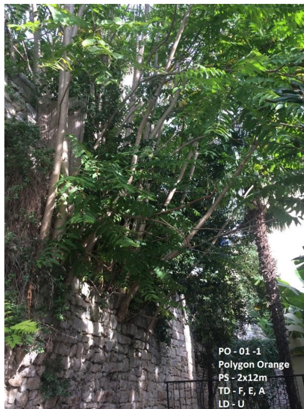
Figure 5. Example of an infestation site with comments assigned to the waypoint. PO-01-1 = Poreč, mapping area 1, infestation site 1; Polygon orange = dense infestation areas (2–5 plants/m 2 ); PS = polygon size; TD = type of damage, F (functional), E (environmental), A (aesthetic); LD = location of damage, U (urban).