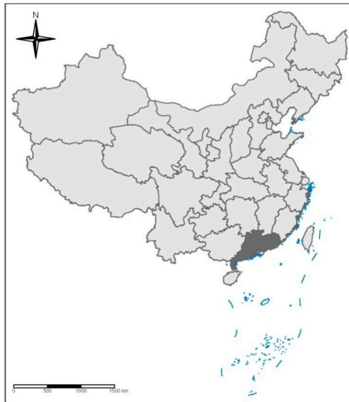
Figure 1. Location of Guangdong Province, southern China (highlighted in black).