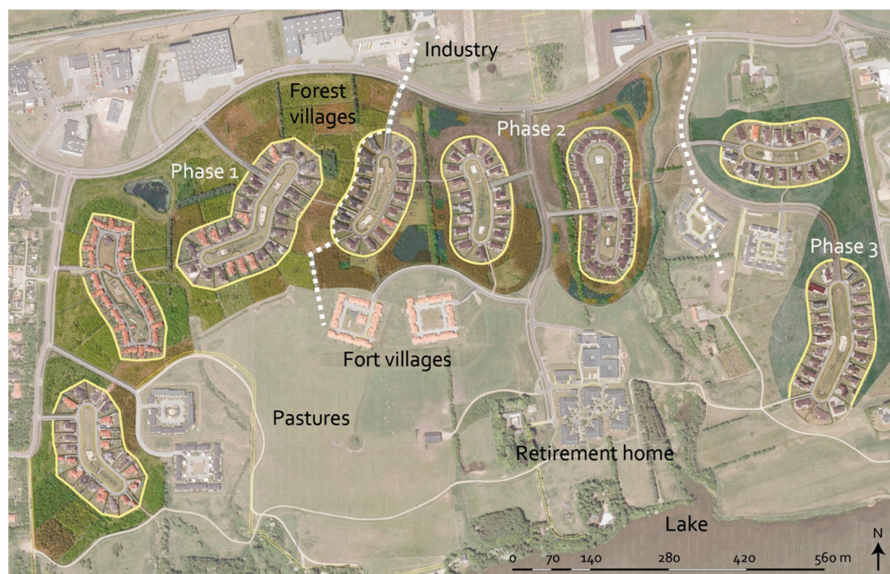
Figure 1. Plan of Sletten. Varied woodland surround the forest villages. The colored fields in the woodland correspond to the 52 different stand types. The yellow border around each forest village shows the stipulated width of the co-management zone, i.e., the first 4 m of the public woodland. Based on an aerial photo.

The woodlands in Sletten were established as a publicly accessible “landscape laboratory” in three phases, in parallel to residential development, in the period of 1999–2004. Landscape laboratories are experimental woodland areas in a local landscape context where innovative design and management concepts for urban forests are tested in full scale [36]. The woodland design comprised 52 stand types and 85 tree and shrub species, resulting in differing appearance (e.g., tree height, planting distance, vegetation structure, and species composition) between different parts of Sletten [32].