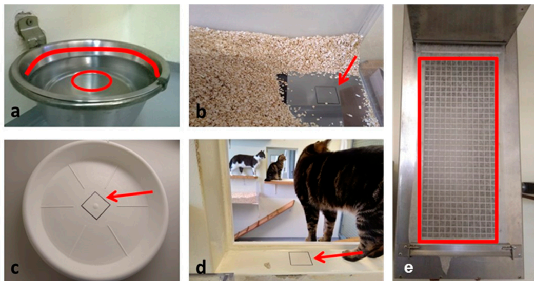
Figure 2. Collection of environmental samples to test for FCV contamination in the cat rooms. (a) Water bowl: Four cotton swabs were humidified with sterile phosphate buffered saline (PBS) and rolled over the area above the water level (red line). Four cotton swabs were soaked with the water from the bowl without pre-humidification (red circle). (b) Litter tray: Four cotton swabs were humidified with sterile PBS and rolled over the 6 \times 6 \text{ cm}^2 marked area (red arrow). Two identical litter trays were available for