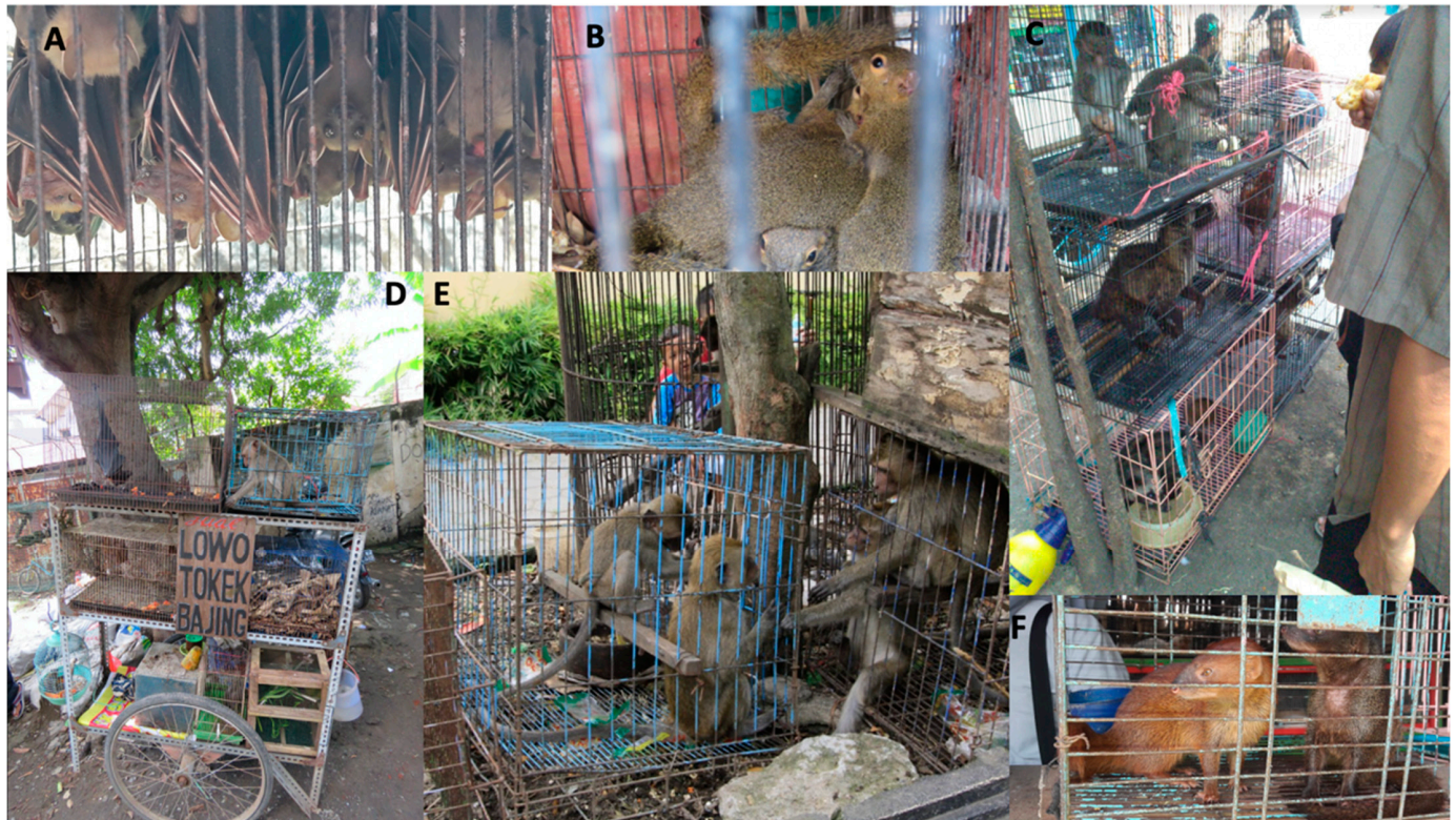
Figure 1. Trade in wild mammals in Java, Indonesia. (A) Indonesian short-nosed fruit bat ( Cynopterus titthaecheilus ); (B) plantain squirrel ( Callosciurus notatus ), (C) long-tailed macaque ( Macaca fascicularis ) and Asian palm civet ( Paradoxurus hermaphroditus ); (D) long-tailed macaque and giant fruit bat ( Pteropus vampyrus ); (E) long-tailed macaque; (F) Javan mongoose ( Urva javanica ).

( Callosciurus notatus ) (20%), followed by the large flying fox ( Pteropus vampyrus ) (13%) and Indonesian short-nosed fruit bat [ Cynopterus titthaecheilus ; possibly in western Java also greater short-nosed fruit bat ( Cynopterus sphinx ) (10%)]. Informal conversations with sellers indicate that most of the animals must have been collected within Indonesia, mostly on Java, Bali and Sumatra, but also Borneo and possibly Sulawesi. None, or very few may have come from abroad.