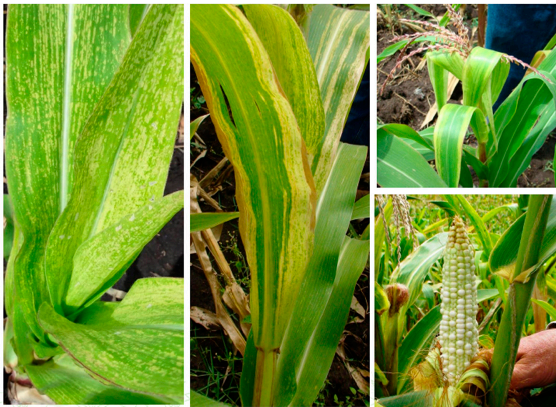
Figure 2. Maize Lethal Necrosis disease symptoms.