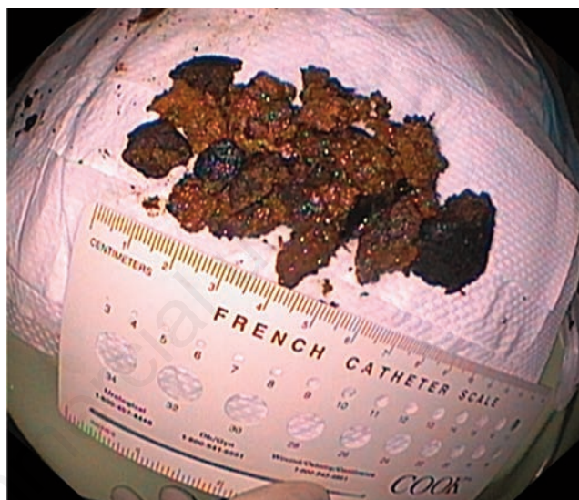
Figure 2. The fragments of the gastric bezoar removed from the stomach.