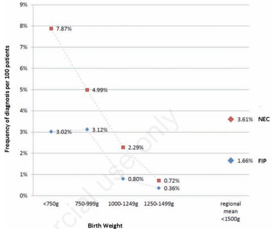
Figure 1. Cumulative regional frequency of acquired intestinal diseases per 100 VLBW infants in Baden-Württemberg in the years 2010 to 2012. Patients were stratified by birth weight in intervals of 250 g each. In all birth weight strata, rates of necrotizing enterocolitis (NEC) are at least twice as high as the rates of focal intestinal perforation (FIP).

mately 3%) but was nearly 9 times higher than in infants with a BW between 1250 and 1499 g (0.36%). The frequency of NEC increased with decreasing BW and was more than 10 times