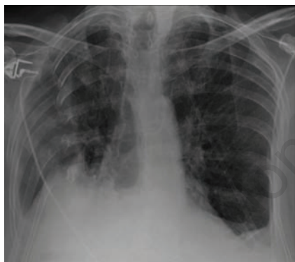
Figure 1. Chest X-ray showing a large flail chest underneath the scapula.

Follow up at present has been at 7, 4 and 3 months respectively. At one-month postoperative follow-up appointment, all three patients had discontinued all painkiller medications, without complaining any chronic chest pain and they all returned to normal life. We are not aware of any further complications that may have occurred to them after discharge from the outpatient clinic.