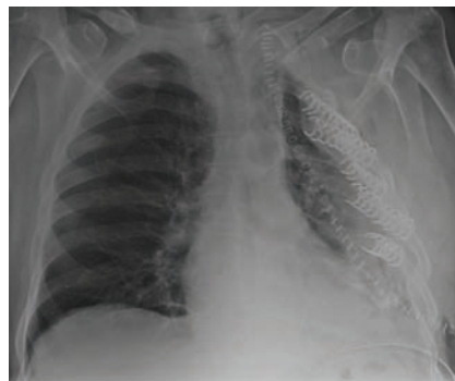
Figure 3. Chest X-rays showing an excellent anatomical correction.

results are encouraging. Our results are also supported by a recent survey where the majority of surveyed surgeons reported that rib and sternal fracture repair is indicated in selected patients; even if a much smaller proportion indicated that they had performed the procedures. 13