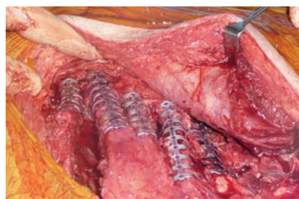
Figure 2. Intraoperative view with clips applied onto the ribs.