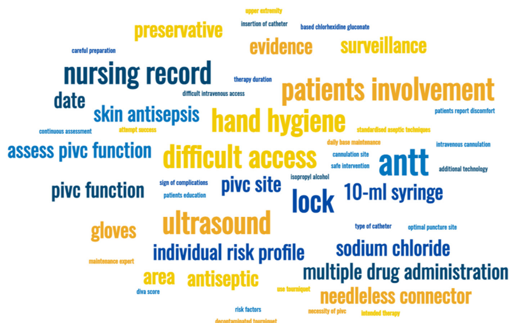
Figure 2. Word map reflecting the initial item pool.

After reviewing the report sent by the research team, the vascular access specialists proposed a total of 49 interventions that mirror their beliefs of essential care steps that Portuguese nurses should perform to overcome current quality and safety challenges. Although some shared a mutual focus, these proposed recommendations varied greatly in the terminology and sentence structure (Figure 2).