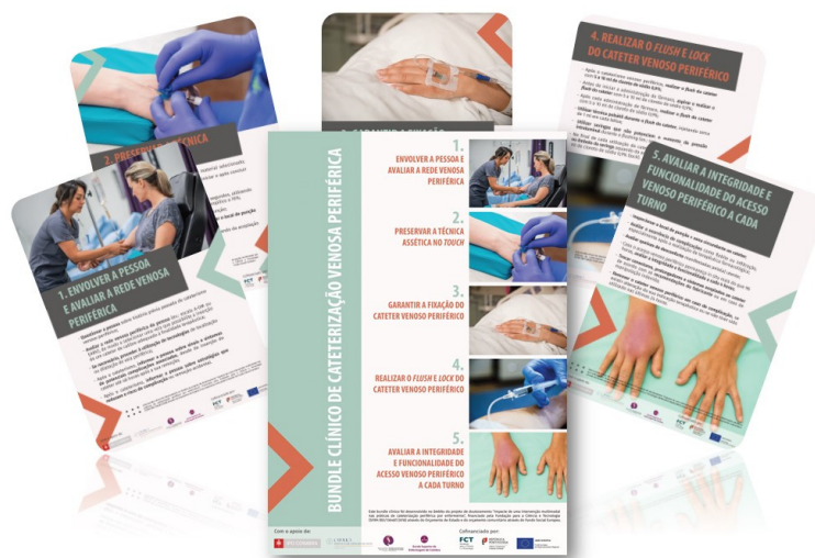
Figure 3. The graphic representation of the developed PIVC bundle.

To enhance the PIVC bundle's applicability and ease of use, the research team included guiding recommendations for each EII. The bundle's content was then translated from English into European Portuguese by two independent native speakers with a background in health sciences and vascular access to ensure the correct use of clinical terminology. During this process, no major challenges were faced concerning the bundle components' semantic, conceptual, experiential, and idiomatic equivalence. With a graphic designer's help, the research team developed the visual representation of the PIVC bundle (Figure 3).