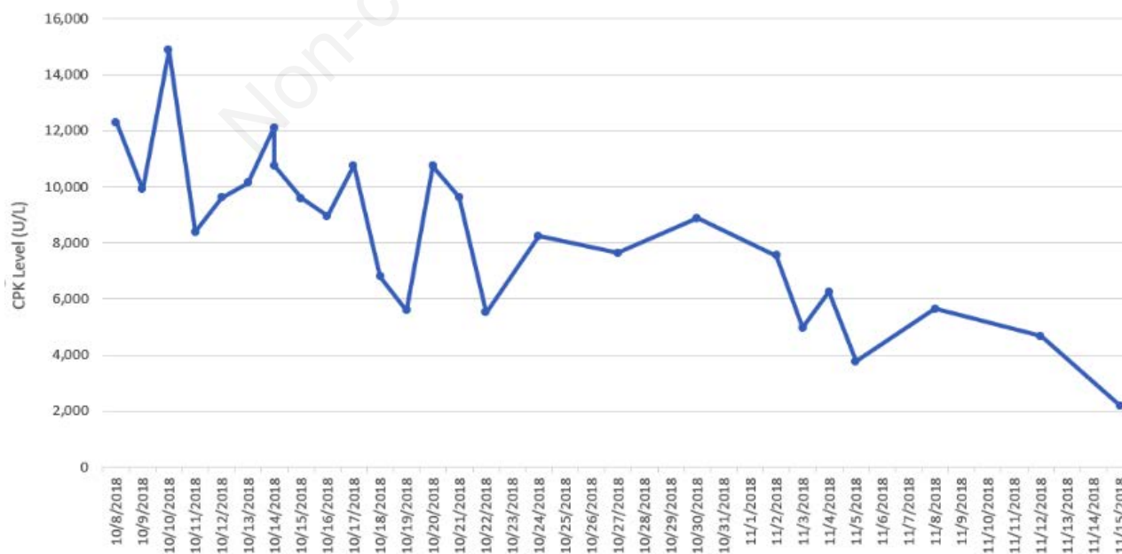
Figure 3. Down trending creatine phosphokinase (CPK) levels with immunotherapy.

Statins are widely used and lower the risk of death from cardiovascular causes. Statin-induced myalgias and myopathies improve with withdrawal of statin therapy and supportive care. By contrast, statin-induced IMNM is a potentially fatal autoimmune disease that follows an aggressive clinical course and often presents with progressive muscle weakness, elevated CPK levels, myonecrosis, and anti-HMG-CoA reductase antibodies. Treatment includes discontinuation of the statin and initiation of immunosuppressive agents.