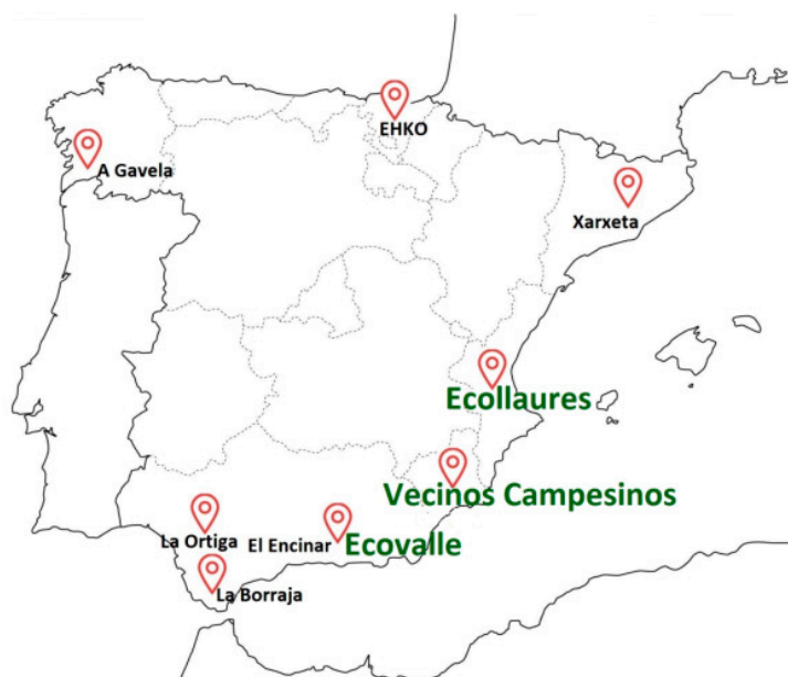
Figure 1. Map of Spain with its different autonomous communities (grey dotted lines). Drops: well-established Participatory Guarantee Systems (PGS) initiatives in Spain in the year of research (2016); in green: the three PGS initiatives studied: Ecollaures, Vecinos Campesinos and Ecovalle (own creation, Paint, Microsoft Office package, 2010).

The PGS initiatives studied are located in the Spanish regions of Valencia (PGS Ecollaures), Murcia (PGS Vecinos Campesinos) and the Valley of Lecrín, Granada (PGS Ecovalle) (Figure 1). They were chosen for their proximity and different characteristics. Based on the authors' own empirical data, they can be characterized as follows: