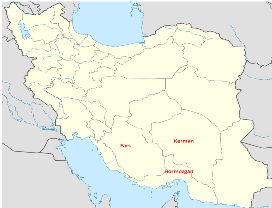
Figure A1. Areas of the study: Map of Iran. Scale: 1:1,800,000, Source: https://upload.wikimedia.org/wikipedia/commons/b/be/Iran_location_map.svg .

belong to the mining industry (oil, gas, steel, aluminum and related products), fishing industry and import/export industry. According to the Global Entrepreneurship Monitor (GEM) data in 2014 ( https://www.gemconsortium.org/country-profile/71 ), most of Iranian entrepreneurs are male and have 25 to 44 years old; most of them hold academic degree (more than 50%).