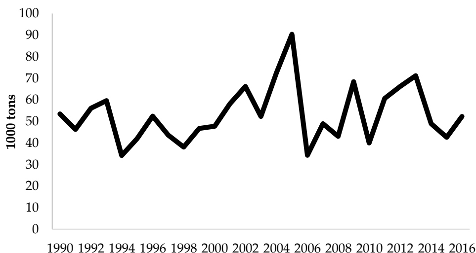
Figure 2. Trends in Tanzanian coffee production (1000 tons), 1990–2016.

in 1994 and 90,000 tons in 2005, averaging 53,000 tons per year during the study period. Part of these fluctuations is attributable to the biennial bearing nature of coffee trees, i.e., yielding a heavy crop in one year and a light crop in the following year [35]. As coffee production is significantly price-elastic, market prices are another main driver causing fluctuations in production [31]. For instance, following the international price spike in 2009 resulting from a global food crisis, Tanzanian coffee production increased from 43,000 tons in 2008 to around 70,000 tons in 2009.