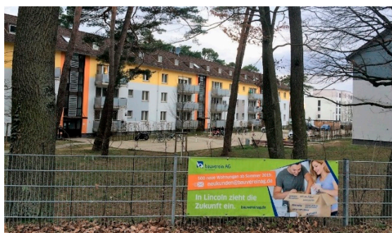
Figure 2. ‘Lincoln is where the future moves in’ (Photograph taken by Sina Selzer, March 2019).

At some point, nobody will talk about Lincoln being a car-reduced neighborhood anymore because that will just be the way it is (interview C1).