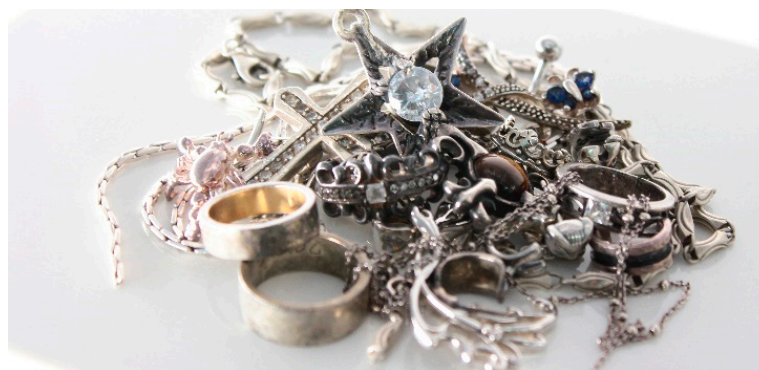
Figure 1. Chyhjiun Silver jewelry recovered in a single store.

Chyhjiun Jewelry was founded on 25th September 1995. It is a silver jewelry brand in Taiwan, using sterling silver with a 925 mark as its raw material with a professional, complete design and development team. Starting from sketches, followed by combining the registered trademark, symbol, and emblem with jewelry, and finally manufacturing at the metalwork department, the company sells products in eight Taiwan stores and online, and provides a professional after-sales maintenance service system as well as a complete silver recycling service in order to continue the spirit of sustainable design and reflect the values of circular economy [28]. The status and number of silver jewelry recovered in a single store are shown in Figures 1 and 2. The number of monthly recoveries in the early stage of the implementation of the recovery mechanism was not stable. Since August 2019, the number of monthly recoveries has been around 15–16; therefore, it is concluded that the promotion of the concept of circular economy and the service of recovery mechanism of Chyhjiun Jewelry have achieved preliminary results. After the product path is developed for new products, maintenance is required due to silver oxidation. Jewelry damage can be repaired. When the damage is serious or it is no longer worn, it can be recovered, thus cycling the product path.