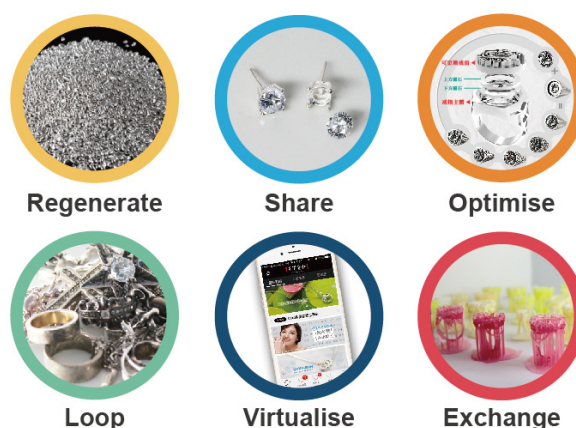
Figure 3. Chyhjiun Jewelry’s developable ReSOLVE business model diagram.