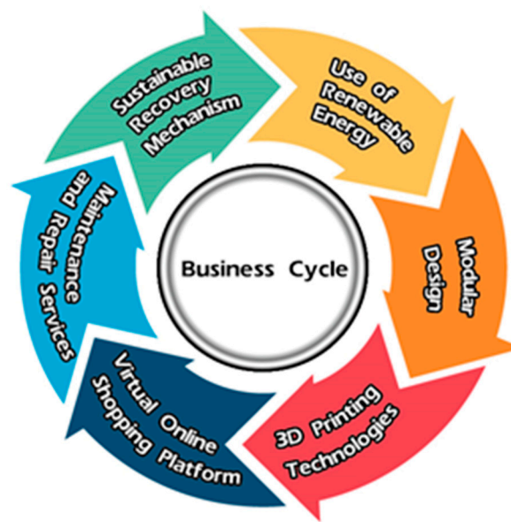
Figure 4. Chyhjiun Jewelry's circular business model.