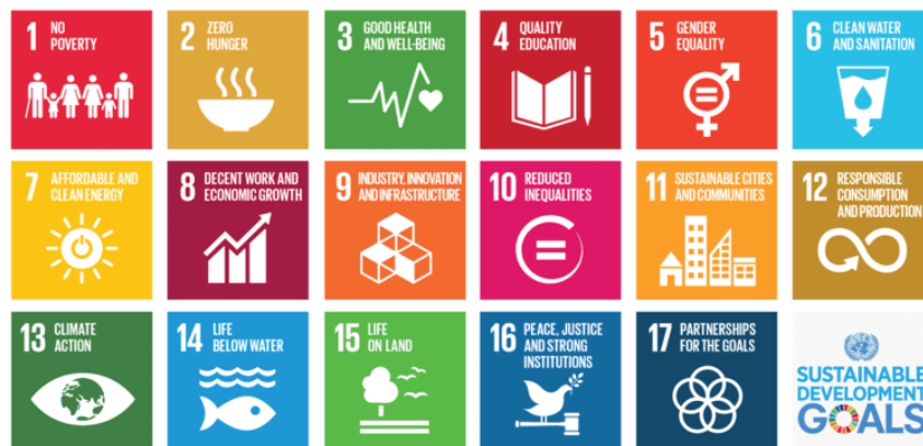
Figure 1. List of the 17 Sustainable Development Goals (SDGs).

move to this second phase. This process allowed us to deepen the analysis. Thus, in the second phase, after another process of inter-judge negotiation, 19 projects were discarded (31.15% of the initial works).