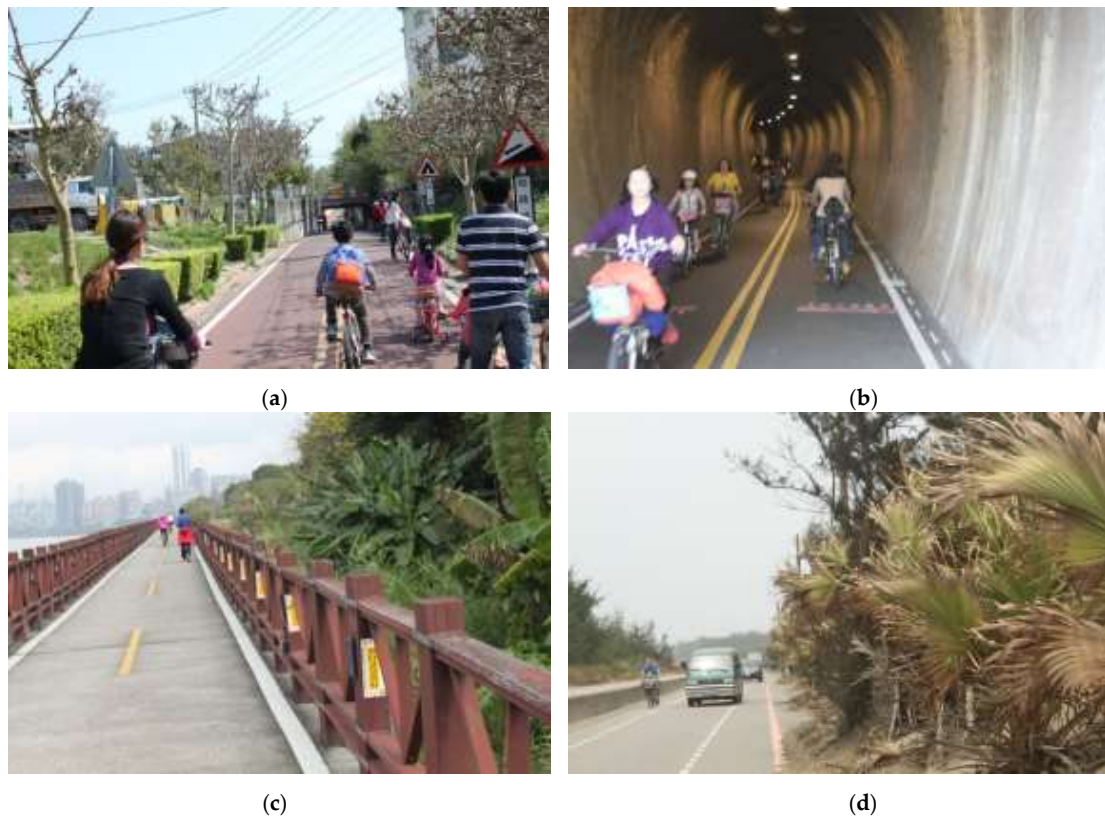
Figure 1. Several types of bicycle paths in Taiwan: (a) urban recreation and commuting, (b) tunnel path, (c) riverside path, and (d) shared path.