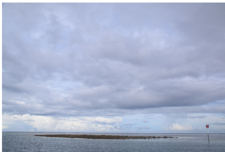
Figure 7. Rarata Island in Langalanga Lagoon.

9 m (!) storm surge that flooded the artificial islands in Langalanga in 1966 [59]. A year later, in 1967, cyclone Annie destroyed houses and coconut plantations in North Malaita, and in 1972, tropical cyclone Ida caused massive devastation in the province and encouraged landward migration [35]. Several artificial islands in Langalanga Lagoon, such as Rarata Island, were permanently abandoned after cyclone Namu in 1986, the worst tropical cyclone to have affected Solomon Islands on record (see Figure 7). It illustrates that tropical storms have always been an integral part of life for coastal communities in the archipelago [60]. In fact, cyclones also create opportunities: The village of Abitona in East Malaita was built on a sandbank created by a severe cyclone in the 1920s. The new land proved attractive to settle on, particularly as there were no existing land claims. Nowadays, the village is flooded by king tides in December and January, but whether this is a new phenomenon or caused by climate change, soil compaction, the cutting of mangroves, or a combination of these factors, remains unclear.