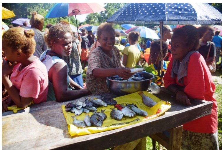
Figure 2. Women barter fish for root crops in Lau Lagoon (J. van der Ploeg 2017).

The distinction between wane asi (saltwater people or to’aiasi) and wane tolo (forest people or to’aitolo) is a salient feature of human ecology in Melanesia [17,18]. The wane asi are fishers who barter fish for root crops and vegetables with the wane tolo, shifting cultivators who inhabit the forested interior of Malaita (see Figure 2). This distinction is not absolute. Nowadays, many wane asi maintain agricultural plots and many wane tolo are fishing, and intermarriage is common [19]. Nonetheless, many communities continue to identify themselves as wane asi: The livelihoods, worldview, and identity of these people revolve around fishing and the sea.