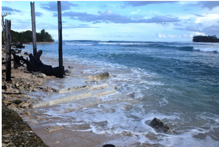
Figure 4. The remains of the Anglican church of Fanalei (J. van der Ploeg, 2018).

A closely affiliated ethnic group are the Kwai, who live on two densely populated islands on the East coast of Malaita: Kwai and Ngongosila. People here speak Guala'ala'a, which was used as a trading language along the coast [21]. Reliable census data is lacking but it's estimated that around 900 people live in these two communities. The saltwater people from Kwai and Ngongosila, and several other small artificial islands scattered around Uru Harbor, trade fish with the Kwaio people from the uplands. Ngongosila was settled in 1955 when the South Sea Evangelical Mission built a church on the island [29].