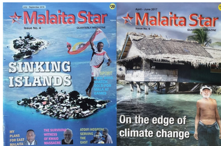
Figure 1. The sinking islands of Malaita (Malaita Star, 2016, 2017).

Similar claims are regularly made in science, policy, and development discourses. There is broad scientific consensus that people on low-lying islands in the Pacific are highly vulnerable to future climate-induced sea-level rise, and that there is an urgent need to invest in adaptation mechanisms [2,3]. But little is known about how local people in remote rural areas, such as Malaita, perceive and deal with climate change [4,5]. Rebecca Monson and Joseph Foukona [6] write in an edited volume on climate displacement that the wane asi in Lau Lagoon increasingly have to cope with changing wind patterns, extreme weather events, and coastal erosion: