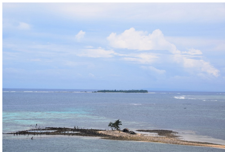
Figure 9. Walande Island on South Malaita.