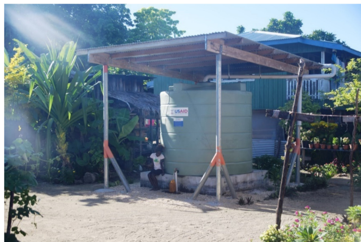
Figure 11. Rainwater storage tank on Kwai Island.