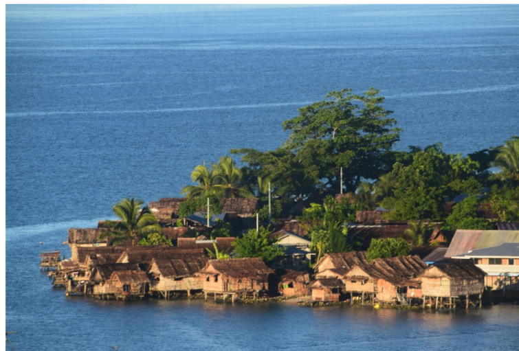
Figure 5. Lilisiana in Langalanga Lagoon.

such as Lilisiana, have grown rapidly over the past fifty years (see Figure 5), and many young and educated people migrate to Honiara in search of a better life.