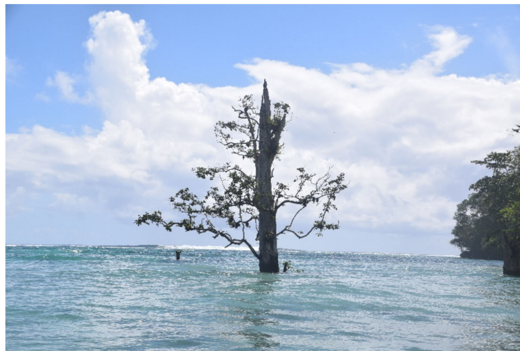
Figure 8. Rapid subsidence on the southeast coast of Malaita (J. van der Ploeg, 2017).

the Anglican Church of Melanesia fostered an agreement with wane tolo land owners, built a church, and encouraged the wane asi to settle in the new village [30]. Interestingly, before settling on Walande Island, people lived on Namu Island, which was abandoned in the 1930s after a tsunami (see Figure 9). And in the mythical past, the ancestors of the people of Walande lived on a small off-shore island called Hile, which was, according to oral history, also destroyed by a tsunami (also see Nunn et al. on the disappeared Pororourouhu Islands off the coast of South Malaita [71]). Other coastal areas on Malaita are also subject to geological upheaval: Gold [72], for example, reports that two severe earthquakes in October 1931 destroyed several artificial islands in Bina Harbor in Langalanga Lagoon. In fact, fear for an impending tsunami or cyclone is an important motivation for many wane asi to move from the artificial islands to the mainland.