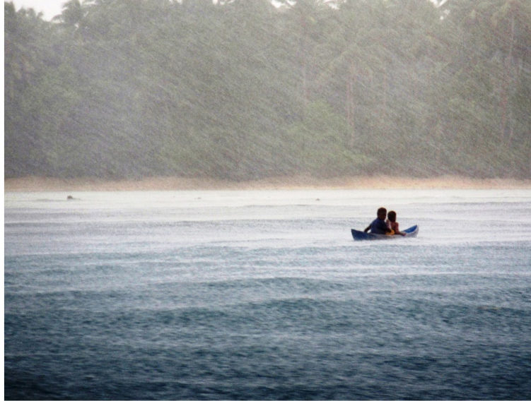
Figure 10. Children on their way to school (J. van der Ploeg, 2016).

Heavy rains can make the daily canoe trip to school hazardous for children (see Figure 10). During the koburu season, women have difficulties travelling to the market. Many wane asi have therefore opted to relocate to the mainland.