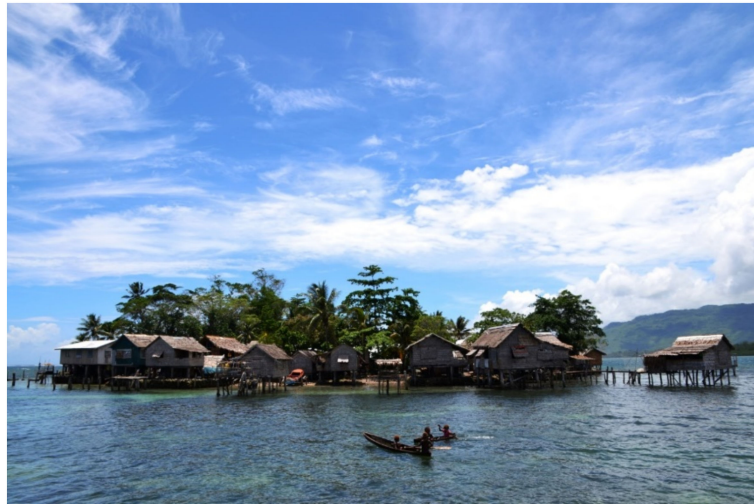
Figure 3. Funafou Island in Lau Lagoon (J. van der Ploeg, 2015).

such as Sulufou, Funafou, Foueda, and Tauba, are relatively large (>1 ha), and are densely populated. Others are very small (<100 m 2 ). Some islands are built as extensions of natural islands or rock outcrops in the lagoon. Others are constructed in the mangroves by constructing coral rock walls, often more than 3 m high, and filling the enclosure with gravel and sand. In most cases, these islets are just above the high-water mark (<30 cm), and most houses are constructed on stilts (see Figure 3).