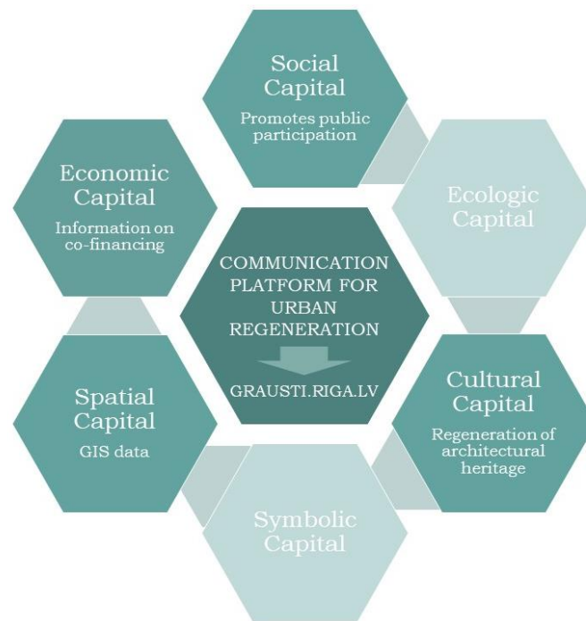
Figure 1. Relevance of Grausti.riga.lv to capital's theoretical approach.

could be seen as a valuable source of data for the earlier discussed graph based mathematical modelling of the capitals and interaction between them, e.g.,: information about status of the buildings might be used for weighting of graph nodes in Spatial capital layer and analysis of its influence on the other layers of capitals; involvement of people into activities in the platform might serve as a good point for social capital modelling; etc.