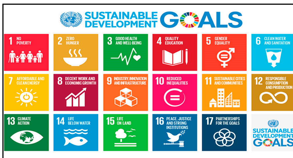
Figure 1. The 17 sustainable development goals. Source: [32].