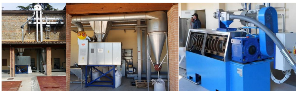
Figure 1. The seed storage, transportation, and sifting set (left); sieve (center); milling machine (right).

The structures and machinery of the extraction plant are shown in Figure 1.