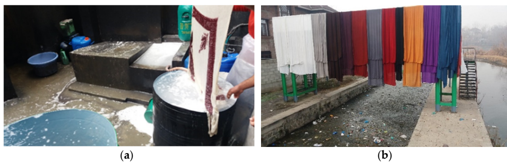
Figure 2. Environmental concerns in the cashmere industry through washing practices and inappropriate outlets of waste leading to water clogging. (a) Washing a handmade cashmere shawl; (b) Water clogging near the washing facility.

Similar to dyeing, the ongoing washing practices are not sustainable and draw attention towards major environmental concerns. After washing the cashmere article, the contaminated water finds its way from the washing facility through the drain (Figure 2a) to the nearby water body which severely impacts the ecology of the area (Figure 2b). As mentioned by a spinner, "the chemicals which are used to get rid of synthetic components from blended pashmina yarn is ultimately left to flow in the nearby water bodies".