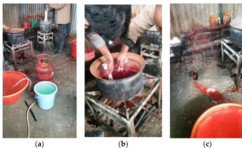
Figure 1. Environmental concerns in the cashmere industry in the dyeing process. (a) Yarn being dyed; (b) Dyers in action; (c) Waste water outlet.

Dyeing the yarn on a finished product is an important process (Figure 1a). In this process, the yarn is exposed to a specific color in a container filled with boiling water (Figure 1b). Once the process is over the water is contaminated with chemicals and is poured on the floor to make its way to the drain (Figure 1c). As observed, the drain enters the nearby water body containing the chemicals and residuals, threatening the ecology of the region.